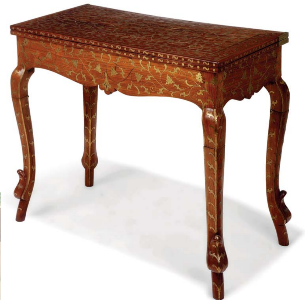
LOT 30 AN INDIAN BRASS-INLAID SOLID SHISHAM (INDIAN ROSEWOOD) CARD-TABLE PROBABLY CHINIOT DISTRICT, MID- 19TH CENTURY £5,000-8,000 THE ISMAIL MERCHANT COLLECTION 07.10.09