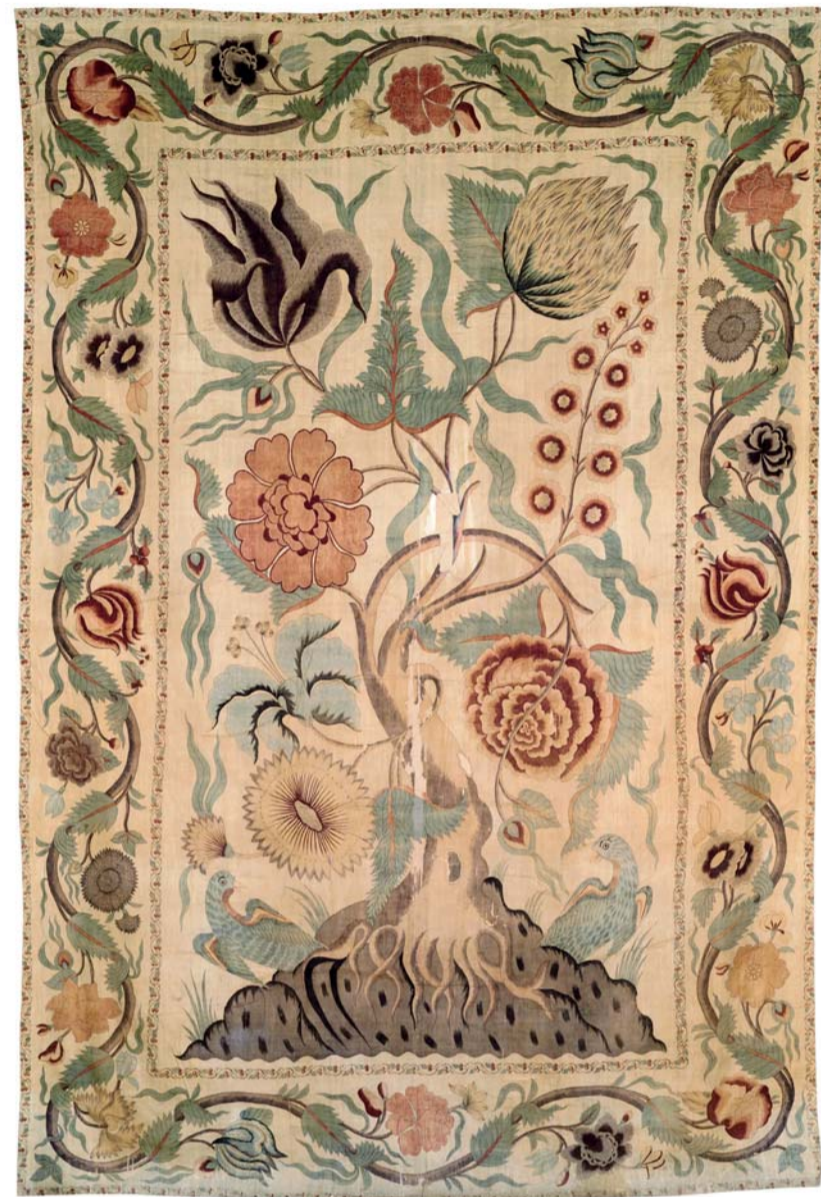
LOT 76 A LARGE SOUTH INDIAN PRINTED COTTON PALAMPORE PROBABLY MADE FOR THE EUROPEAN MARKET, SECOND HALF OF THE 18TH CENTURY £20,000-30,000 THE ISMAIL MERCHANT COLLECTION 07.10.09

The diversity of Ismail Merchant's Collection encapsulates his artistic vision. From the fine gilt-heightened detail on the bullock-drawn carriage of Prince Mirza Babur delineated by a Fraser Album artist circa 1815, to the bold and monumental composition, recorded on a grand historical scale in August Schoefft's 'Thugs of India', we find again this dialogue between cultures. A Shisham card table with intricate brass inlay purchased from the Chor Bazaar in Mumbai, and the hot colours of Kashmiri shawls cross shores and sit alongside a fine pair of 18th-century Italian mirrors formerly in the collection of Paramount Pictures and French Empire candelabra similar to a pair in Malmaison. Once housed in his London, New York and Parisian homes, many of the pieces graced the hallowed halls of cinema history by appearing as stars in their own right as props or interior decoration in films such as Heat and Dust, The Golden Bowl, Surviving Picasso and Howards End. (To find out more about these works search christies.com for sale 5980, lots 18, 31, 32 and 183-186.)