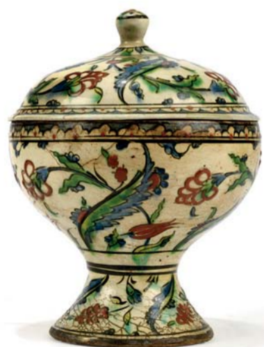
LOT 10 AN IZNIK POTTERY COVERED BOWL TURKEY, EARLY 17TH CENTURY £3,000-5,000 THE ISMAIL MERCHANT COLLECTION 07.10.09

“For Indians such as myself the films of Ismail Merchant opened up a world far beyond the cinematic adventures of our favourite Bollywood movies. Instead of predictable blood rivalries, antipathetic mothers-in-law and forbidden marriages, we tasted a diet of subtle flavours, universal themes explored through obscure characters in very particular circumstances: an art dealer hoping to acquire miniature paintings from a maharaja and his sister, a nostalgic Indian princess living in a London flat, a hopeful English woman visiting India who falls in love with an Indian film star and a memsahib who loses her heart to a raja. The dialogue between India and the West ran as a common thread through these films, which articulated the mutual fascination between the two cultures through personal perspectives. For myself, the works of Merchant Ivory resonated deeply, evoking an interest in the encounter between Britain and India that went on to inspire my own academic interests. The visions of India conjured up in these films were matched by those which Ismail Merchant and James Ivory set in the West, creating moments of beauty unequalled in the history of cinema, of Lucy Honeychurch in a field of barley or of the first hot-air balloon rising over Versailles.