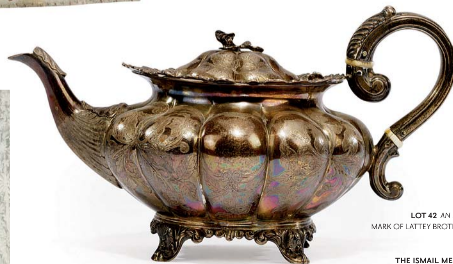
LOT 42 AN INDIAN COLONIAL SILVER TEAPOT MARK OF LATTEY BROTHERS AND COMPANY, CALCUTTA, CIRCA 1850 £1,000-1,500 THE ISMAIL MERCHANT COLLECTION 07.10.09

FIND OUT MORE AT christies.com BY SEARCHING SALE # 5980