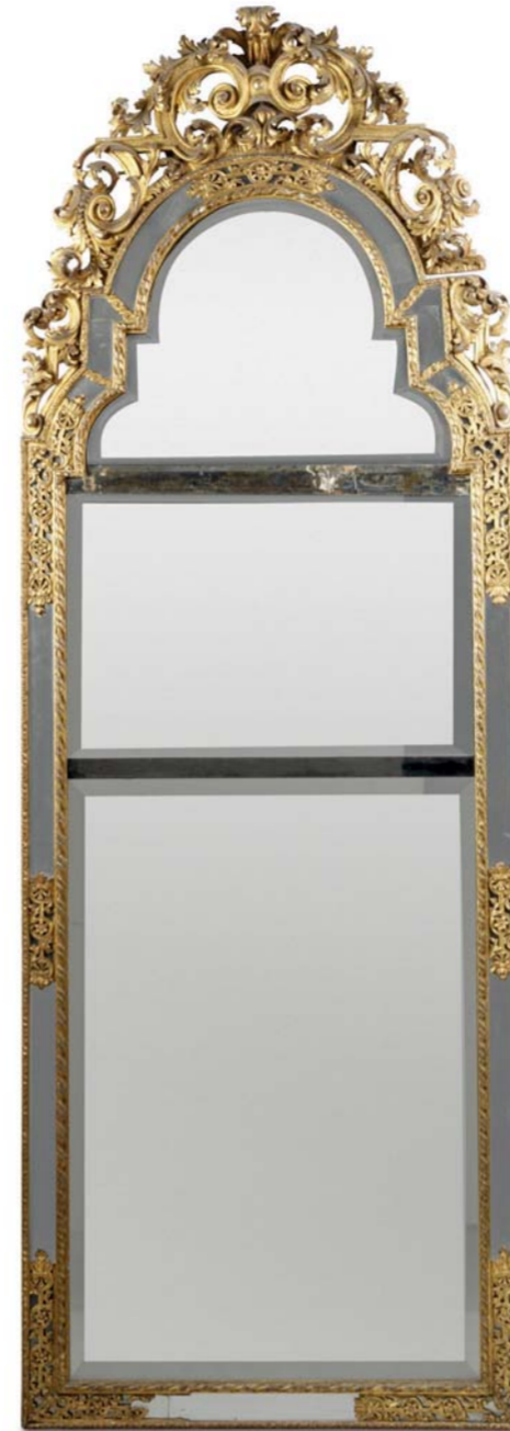
LOT 152 A WILLIAM III GILTWOOD PIER MIRROR CIRCA 1700 £15,000-25,000 THE ISMAIL MERCHANT COLLECTION 07.10.09