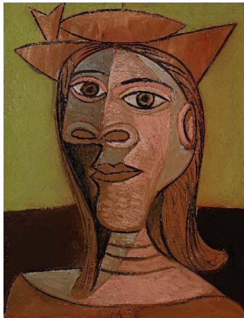
Pablo Picasso (1881-1973) Femme au chapeau , 1938 (estimate: £2,500,000-3,500,000)