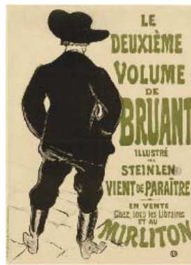
Henri de Toulouse Lautrec Aristide Bruant , 1893 lithograph in colors $8,000-12,000