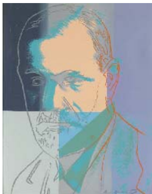
Andy Warhol Sigmund Freud , 1980 screenprint in colors $10,000-15,000