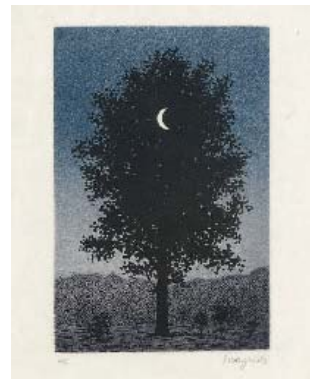
After Rene Magritte Le 16 Septembre , 1968 Etching in colors $3,000-3,500