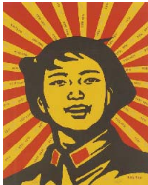
Wang Guangyi Face of the Believer , 2003 Lithograph in colors $4,000-6,000