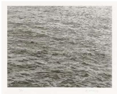
Vija Celmins Ocean with Cross #1 , 2005 Screenprint $5,000-7,000