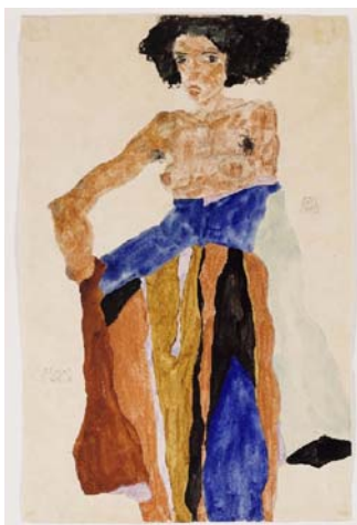
Egon Schiele Moa , 1911 Estimate: £2,400,000-3,200,000