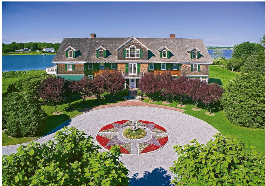
The Atwater Estate, Westhampton Beach, NY

RARE 1929 MAGNUM OF MOËT & CHANDON AUTOGRAPHED BY TINA FEY, ROBERT DOWNEY, JR., MATTHEW BRODERICK AND OTHERS TO BE AUCTIONED FOR CHARITY