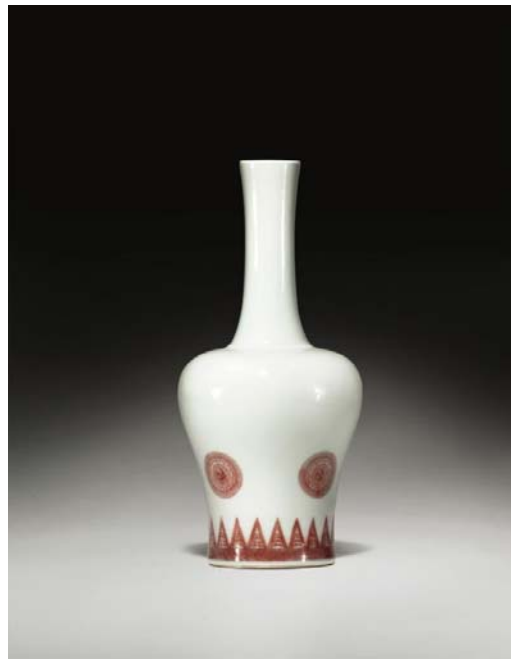
A rare and finely painted underglaze copper-red and blue 'mallet' vase, Yaoling zun , Kangxi six-character mark in underglaze blue and of the period (1662-1722) Estimate: $600,000-800,000

Fine Chinese Ceramics and Works of Art including Property from the Arthur M. Sackler Collections September 14-15, 2009