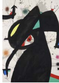
Joan Miró Femme oiseaux , 1973 Gouche and oil on paper 88 x 64 cm. Estimate: €250,000-350,000