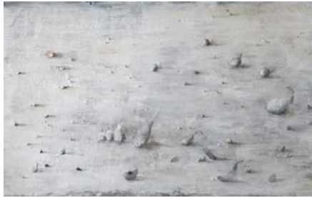
Miquel Barceló Dejeuner sur l'herbe II , 1989 Mixed media on canvas 205 x 333 cm. Estimate: €350,000-550,000