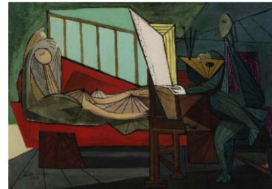
Óscar Domínguez Le peintre et son modèle , 1945 Oil on canvas 61 x 90 cm. Estimate: €300,000-450,000