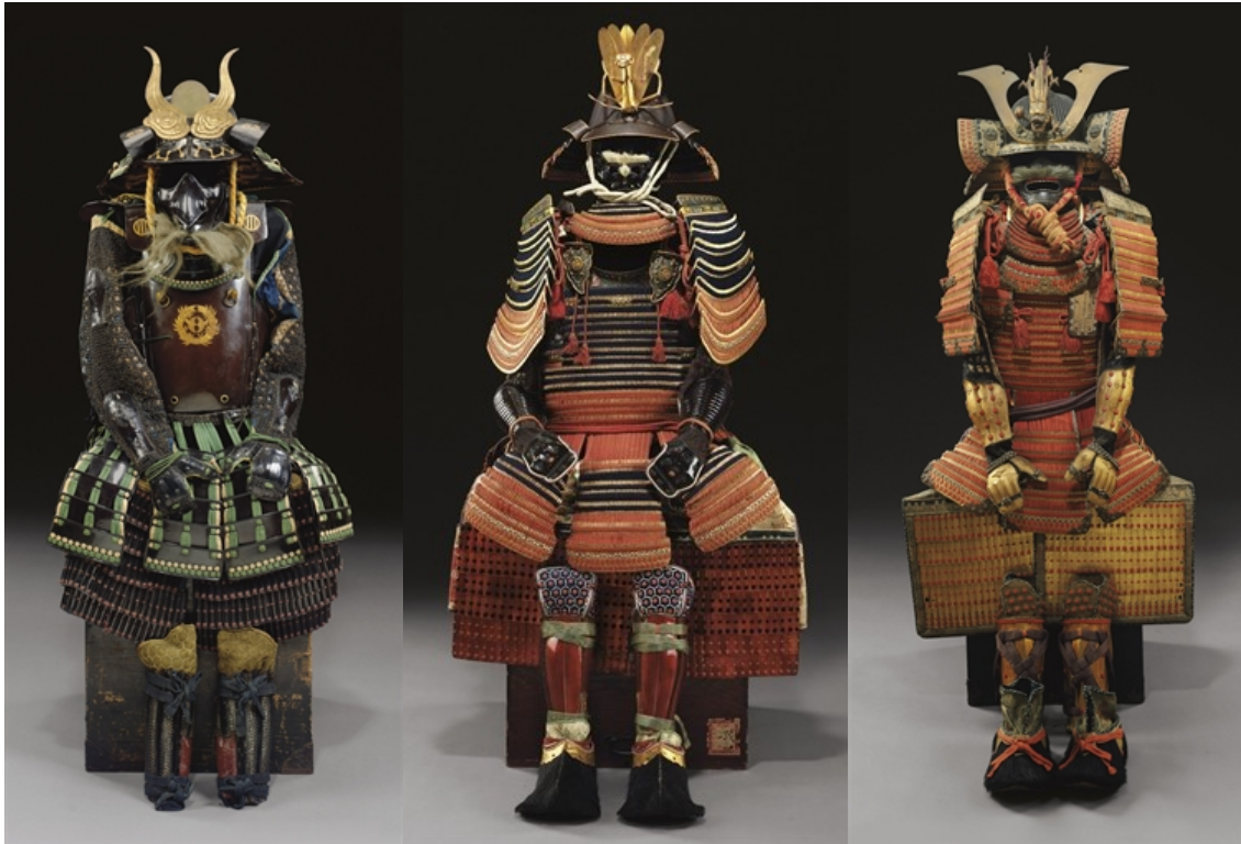
A Gomai-Do Yukinoshita armor Edo Period (17 th century) Estimate: $80,000-100,000