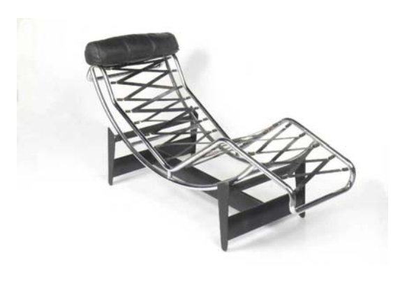
Chaise Longue, 1928 by Le Corbusier Estimate: £15,000-20,000 in Important 20th Century Design

Christie's South Kensington: Modern Design – 20 October 2004 Christie's King Street: Important 20<sup>th</sup> Century Design – 3 November 2004