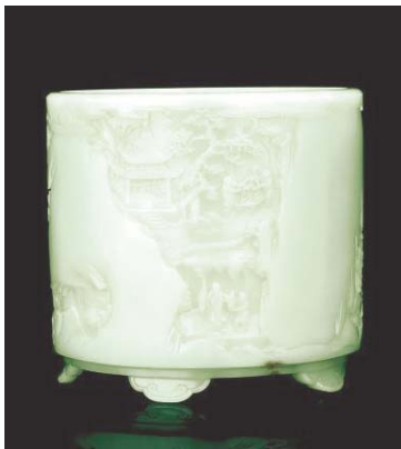
A magnificent white jade cylindrical brushpot, Qianlong period (1736-1795) (Lot 1518) 18 cm. high Estimate: HK$10,000,000-15,000,000/ US$1,300,000-1,900,000