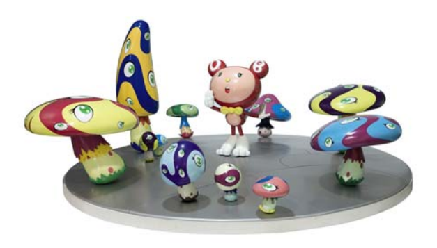
©1999 Takashi Murakami/Kaikai Kiki Co., Ltd. All Rights Reserved.

Highlighting the contemporary section is Takashi Murakami's fantastic sculpture DOB in the Strange Forest, 1999 (estimate: $5 to 7 million) – pictured left. This work, featuring Murakami's most frequent and favored protagonist DOB , plunges the viewer into the hallucinatory, cutesy yet twisted world of this modern master. True to the artist's signature style, this work presents a new hero for a new era, an art