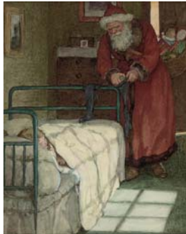
Kate Greenaway, R.I. (1846-1901) A visit from Father Christmas Estimate: £7,000-10,000