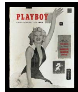
A rare Marilyn Monroe Calendar, 1955 Estimate: £4,000-6,000

Over 200 lots of memorabilia from the stars of the stage, screen and musical worlds will be offered, all of which are sure to bring a smile to any film fan's face should they find them under their tree on 25 December. Spanning 50 years of show business, the sale offers props, property, costume, scripts and all manner of autographed memorabilia from some of the most iconic actors and actresses of all time. Estimates start from £400 for a signed publicity photograph of Laurel and Hardy circa 1930s and other highlights include the personal crash helmet of Steve McQueen (estimate: £25,000-30,000) and a rare first issue of Playboy, featuring Marilyn Monroe on the cover (estimate: £1,000-1,500).