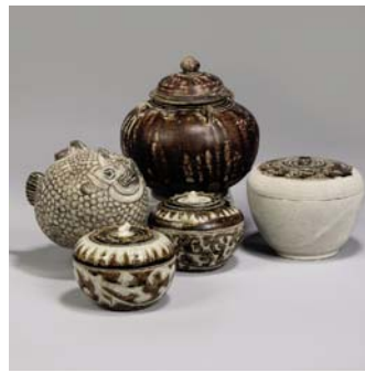
A collection of South-East Asian Ceramics Estimate: £300-500