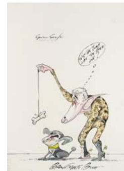
Gerald Scarfe (b.1936) Brown meets Bush Estimate: £3,000-5,000

Open 7 days a week * Free Valuations * Online Bidding * Unrivalled Specialist Expertise