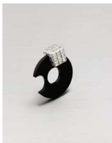
A Diamond and Acrylic ring, Manfred Seitner Estimate: £3,000-5,000