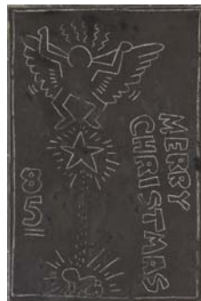
Keith Haring (1958-1990) Untitled (Merry Christmas 1985), 1985 Estimate: £6,000-8,000