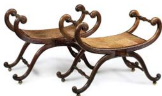
A Pair of Regency Mahogany Window Seats, circa 1810 Estimate: £8,000-12,000

The Sunday Sale: Property from Home Farm, Evenlode, Gloucestershire - Sunday 9