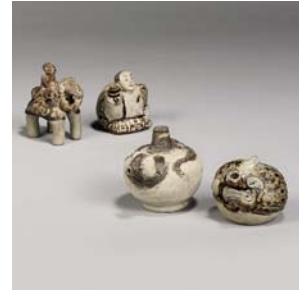
Three Sawankhalok waterdroppers, and a miniature model of a man on an elephant Estimate: £400-600

Formed by Mrs Loose while the Loose family lived in Jakarta between the late 1950s and 1970, and exhibited in museums in Norway and Sweden in 1972 and 1973, this intriguing collection of South East Asian Ceramics, to be sold with no reserve, offers shoppers a chance to buy some subtle and beautiful examples of delicate Thai, Vietnamese and provincial Chinese ceramics which look particularly good when displayed in a contemporary setting. Estimates range from £200 to £1000.