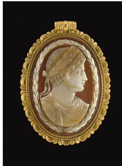
A late Roman sardonyx cameo portrait of the Emperor Constantine Circa early 4 th century A.D. Estimate: $150,000-250,000