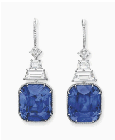
Sapphire and Diamond Ear Pendants 27.46 and 29.50 cts Estimate: $150,000-250,000