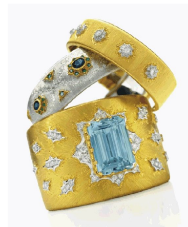
A Trio of Gold Cuff Bangles By Buccellati Estimates range: $8,000-50,000

New York – With the holiday season fast approaching, Christie's is delighted to present two sales of exceptional jewels on December 10, featuring over 180 items suited to every gift-giving need. From rare and important diamonds and gemstones, to signed and period jewels, the sales feature elegant designs by Buccellati, Boucheron, Daniel Brush, BVLGARI, Cartier, Van Cleef & Arpels, David Webb, and Tiffany & Co., among others. The day begins with New York Jewels , a selection of superb jewels, watches, clocks, and unique creations for both women and men, in prices ranging from $1,000 to $2 million. Immediately following the sale will be Magnificent Jewels from a Distinguished Private Collector , a special single-owner collection of ten superb jewels, including the rare and important Evening Star Diamond. The combined sales are expected to realize in excess of $15 million.