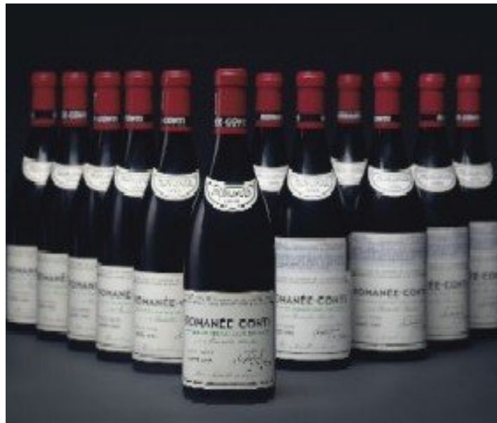
Pictured above: Lots 35 & 36, two lots of 1990 Romanée-Conti Six bottles per lot, estimate: $90,000-120,000

TOP-QUALITY BORDEAUX, BURGUNDY, AND CULT CALIFORNIA WINES TO LEAD A BLOCKBUSTER 2-DAY SALE OF NEARLY 600 LOTS