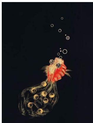
Detail of panel by Jean Dunand