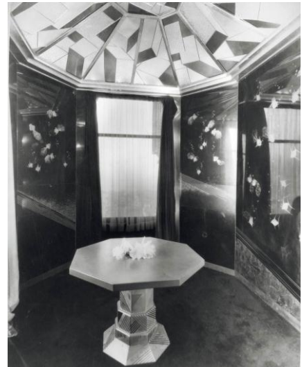
Templeton Crocker's Breakfast Room by Jean Dunand, 1929

Jean Dunand was charged with decorating three rooms; the bedroom (the furniture for which is now in the collection of The Metropolitan Museum of Art), the dining room, and also the breakfast room. Dunand covered the walls of the octagonal breakfast room with exquisite black lacquered panels embellished with effervescent bubbles and shimmering