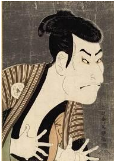
Toshusai Sharaku (act. 1794-95), The Actor Otani Oniji III as Edobei in the Kabuki Play Koi nyobo somewake tazuna , woodcut, okubi-e Estimate: $600,000-800,000