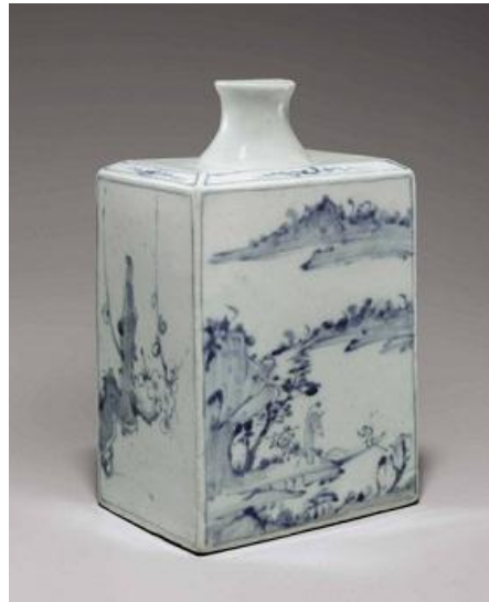
A blue and white square bottle with landscape, plum and bamboo design 18 th century Estimate: $400,000-500,000

New York – On September 14, Christie's is pleased to present the Fall Sale of Japanese and Korean Art, which offers over 250 exemplary works of Japanese and Korean art. With over 100 lots, the Japanese section of the sale will feature Intro from the Collection from the Estate Catherine H. Edson, paintings, lacquer wares, and furniture, while the Korean portion includes fine porcelains, as well as traditional and modern paintings by Korean masters. The sale is expected to realize in excess of $9 million.