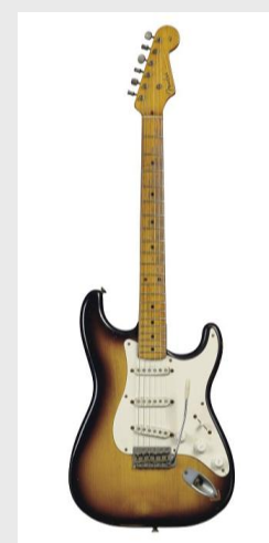
FENDER ELECTRIC INSTRUMENT COMPANY A SOLID-BODY ELECTRIC GUITAR, STRATOCASTER FULLERTON, CA., 1954 Estimate: $30,000-40,000

Further details of the sale and catalogues will be available by mid-September 2011.