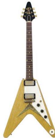
GIBSON INCORPORATED EX-ALBERT KING A SOLID-BODY ELECTRIC GUITAR, FLYING V KALAMAZOO, MI, 1958 Estimate: $60,000-90,000

The first Style D-28 designated by the C.F. Martin Company