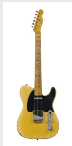
FENDER ELECTRIC INSTRUMENT COMPANY A SOLID-BODY ELECTRIC GUITAR, TELECASTER FULLERTON, CA., 1953 Estimate: $15,000-25,000