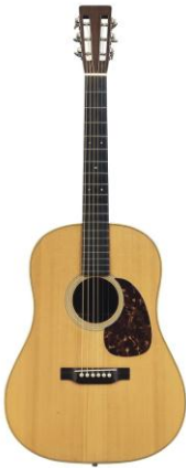
C.F.MARTIN AND COMPANY A GUITAR, STYLE D-28, NAZARETH, PA., 1931 Estimate: $50,000-70,000

The first Style D-28 designated by the C.F. Martin Company