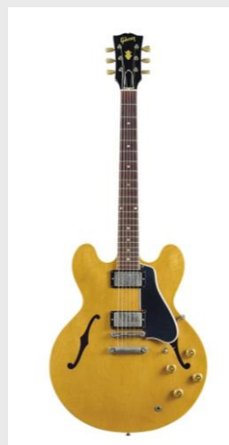
GIBSON INCORPORATED AN ELECTRIC GUITAR, STYLE ES-335 TD KALAMZOO, MI., 1960 Estimate: $20,000-30,000