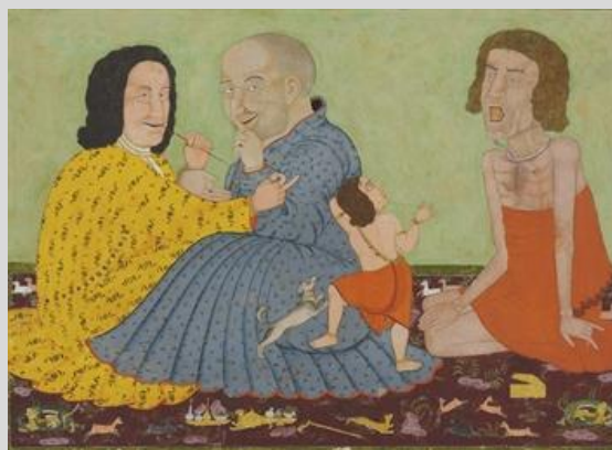
Fools: Europeans Seated on a Carpet India, Rajasthan, Mewar, circa 1760 10¼ x 14¼ in. Estimate: $15,000 – 20,000