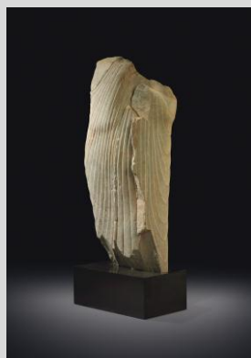
A Limestone Torso of Buddha India, Amaravati, 2 nd Century 37 ½ in. high Estimate: $100,000-150,000