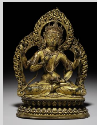
A Gilt Bronze Figure of Manjushri Nepal, 18 th Century 10 in. (25.4 cm.) high Estimate: $30,000-50,000