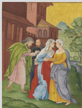
The Visitation India, Mughal Period, 18 th Century 4 ⅛ x 3 ⅛ in. Estimate: $40,000-60,000