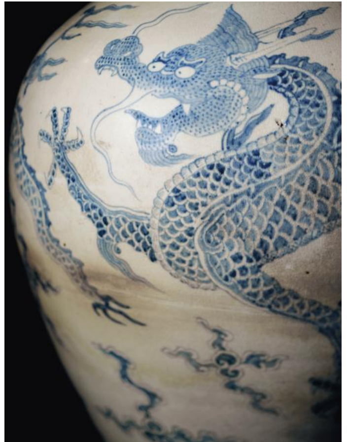
A Blue and White Porcelain Dragon Jar Joseon dynasty, 18 th century Estimate on Request

New York – Christie's is pleased to announce the Fall sale of Japanese and Korean Art , taking place September 11. Featuring over 200 lots with works of art spanning medium and category, the sale offers a fantastic selection for collectors of all interests, from medieval books to paintings by modern masters. A spectacular fusuma (set of interior sliding doors) by Hasegawa Tonin will highlight the Japanese portion of the sale, while the Korean session boasts an exquisite and monumental porcelain dragon jar.