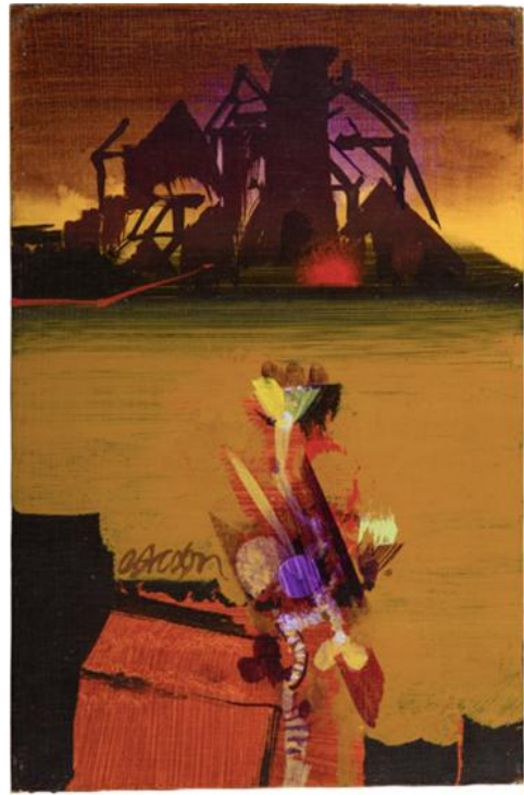
Alejandro Obregón Recuerdo de Trenton , 1975 Oil on wood

New York – Christie's and the Americas Society are pleased to announce The Americas Society Visual Arts Endowment Benefit Auction in May 2013. The auction will include a selection of works donated to the Americas Society that will be offered in conjunction with the Latin American sale with all proceeds to benefit the Society's dynamic and expanding Visual Arts Department through the creation of an endowment for its programs.