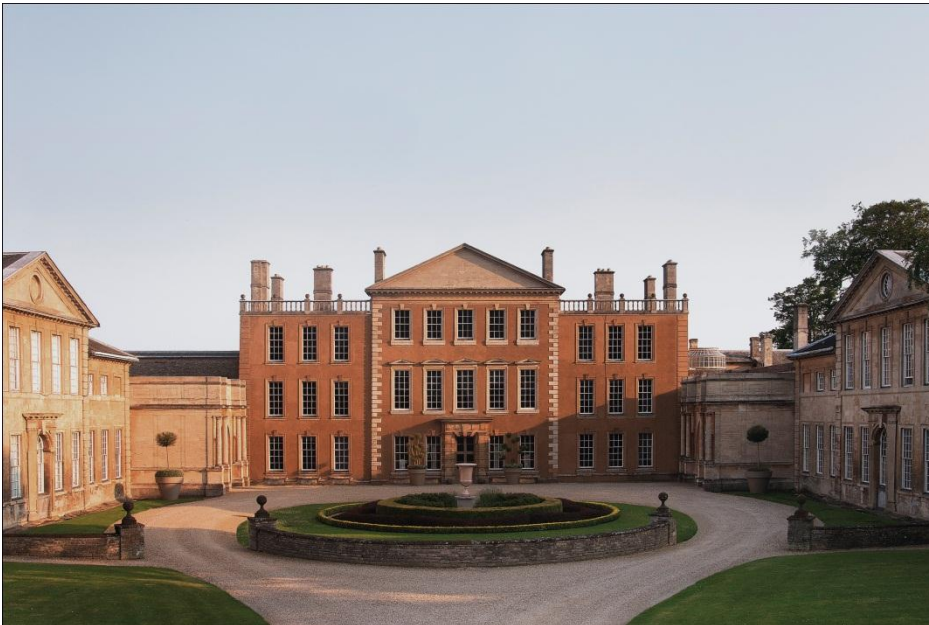
Aynhoe Park, Oxfordshire