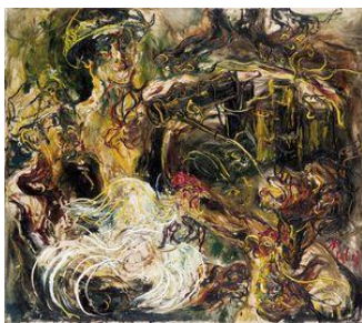
Affandi (Indonesian, 1907-1990) Men with Cockerels oil on canvas oil on canvas Painted in 1964 134 x 119 cm. (52 3 / 4 x 46 7 / 8 in.)

Estimate: HK$ 1,200,000 - 1,600,000 US$ 153,800 - 205,100