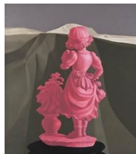
Natee Utarit (Thai, B. 1970) Alice in Ordinary Land oil on linen Painted in 2008 160 x 180 cm. (63 x 70 7 / 8 in.)

Estimate: HK$ 1,200,000 - 1,600,000 US$ 153,800 - 205,100