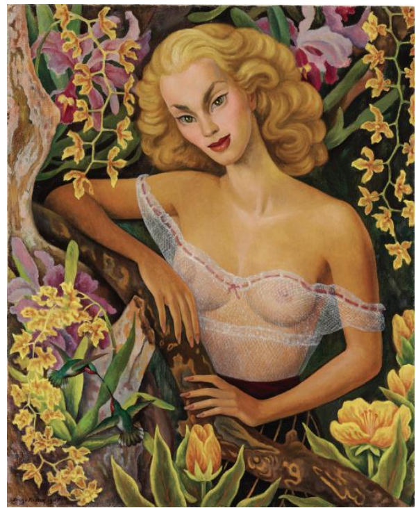
Diego Rivera Portrait of Linda Christian Estimate: $250,000-$350,000

New York –Christie's Latin American Sale will take place on November 20 at 7:00 p.m. and November 21, at 10:00 a.m. This two-session sale of 300 lots total is led by significant works from some of the region's best-known artists spanning colonial art to the present. The Evening Sale features 80 of the sale's most important works, with an exceptional line-up of paintings and sculpture from celebrated Brazilian and Mexican artists, amongst many others. The following Day Sale presents over 200 additional works of art from the Spanish colonial era to the present. The combined sales are expected to realize in excess of $20 million.