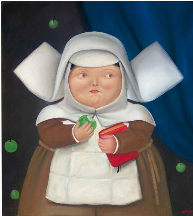
Fernando Botero Nun Eating an Apple Estimate: $500,000-700,000

TWO RARELY-SEEN MASTERPIECES BY DIEGO RIVERA TO BE OFFERED