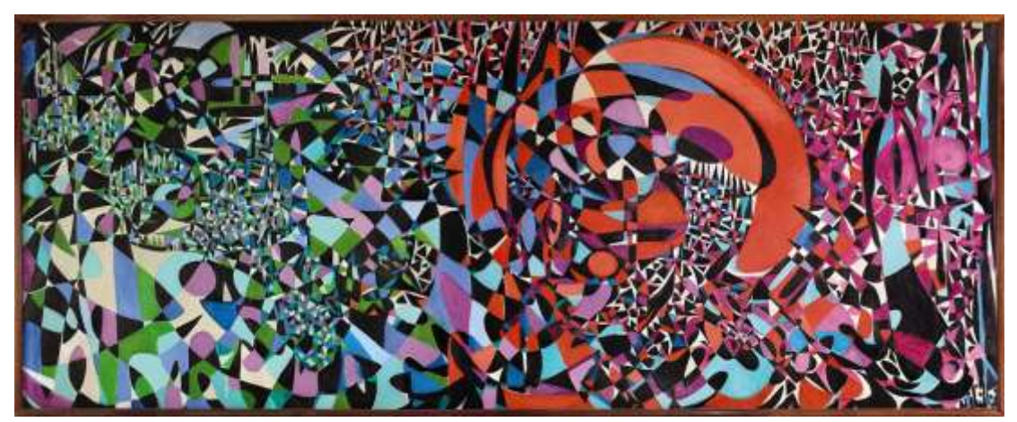
Fahr El-Nissa Zeid, Break of the Atom and Vegetal Life, 1962