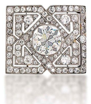
Lot 184 An early 20th century diamond brooch, by Cartier Estimate £25,000 - 30,000