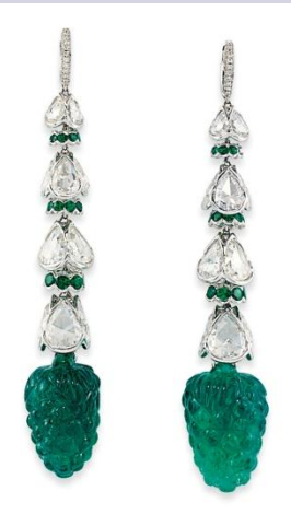
Lot 336 A pair of emerald and diamond ear pendants, by Etcetera Estimate: £130,000 – 160,000