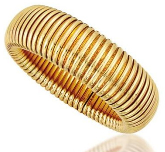
Lot 201 A Tubogas bracelet, by Cartier Estimate £6,000 - 8,000

Lot 172 A pair of cultured pearl and diamond ear clips, by Cartier Estimate £15,000 - 20,000