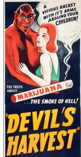
“Devil’s Harvest”, 1942, original film poster Estimate: £6,000 – 8,000