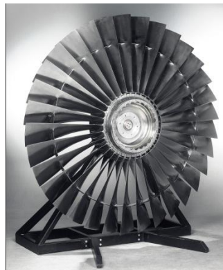
A Stage 1 Rolls Royce titanium turbine fan, circa 1970 Estimate: £60,000 – 80,000