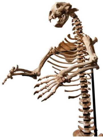
A fossilised cave bear skeleton From the upper paleolithic (circa 30,000 BCE) Estimate: £20,000-£30,000