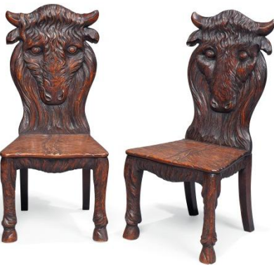
A pair of carved mahogany hall chairs, late 19 th /early 20 th Century Estimate: £2,000 – 3,000