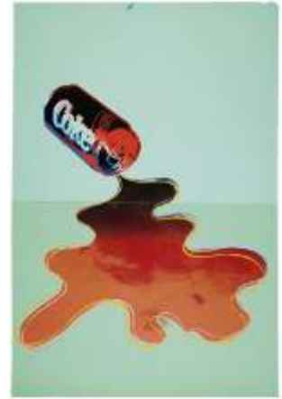
ANDY WARHOL (1928-1987) New Coke (see F. & S. IIIB.44) Executed circa 1985 Estimate: $25,000-35,000 Sold: $93,750