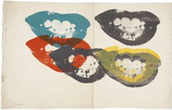
ANDY WARHOL (1928-1987) I Love Your Kiss Forever Forever (see F. & S. II.5) Executed in 1964 Estimate: $3,000-5,000 Sold: $112,500

TO BENEFIT THE ANDY WARHOL FOUNDATION FOR THE VISUAL ARTS