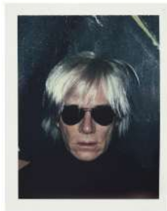
ANDY WARHOL (1928-1987) Self-Portrait Executed in 1986 Estimate: $15,000-25,000 Sold: $35,000