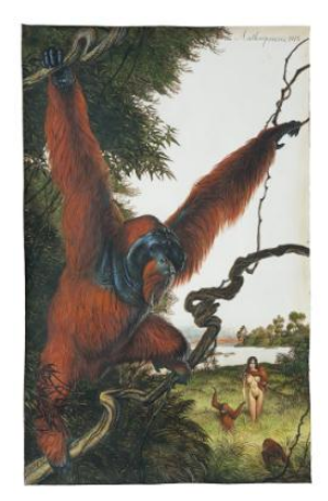
Walton Ford Anthroponosis - 1975 gouache on paper 96 x 60 in. (243.8 x 152.4 cm.) Painted in 2013. Estimate: $400,000-600,000