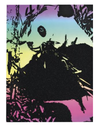
Rob Pruitt (b. 1964) 6:20pm, late Summer glitter and enamel on canvas 96.½x 71.¾in. (245.1 x 182.2 cm.)