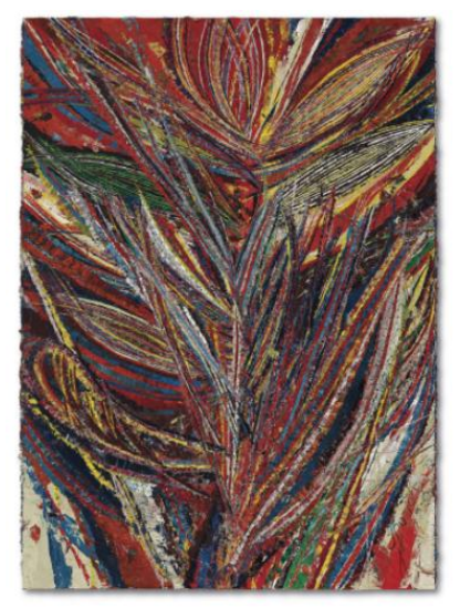
Mark Grotjahn Untitled (Standard Lotus No. II, Bird of Paradise, Tiger Mouth Face 44.01) oil on cardboard mounted on canvas 73 1/4 x 52 7/8 in. (186.1 x 134.3 cm.) Painted in 2012. Estimate: $1,500,000-2,500,000