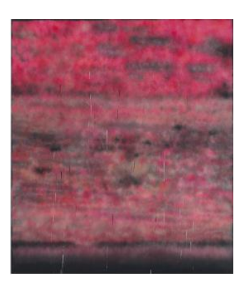
Sterling Ruby SP231 acrylic and spray enamel on canvas 96 x 84 in. (243.8 x 213.3 cm.) Painted in 2013.