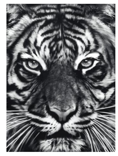
Robert Longo Untitled (Leo) Charcoal on mounted paper 96 x 70 in.(243.8 x 177.8 cm.) Executed in 2013. Estimate: $150,000-200,000

WORLD'S TOP ARTISTS TO DONATE PIECES FOR '11<sup>TH</sup> HOUR CHARITY AUCTION'