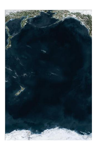
Andreas Gursky Ocean V Executed in 2010. This work is number four from an edition of six. Estimate: $500,000-700,000