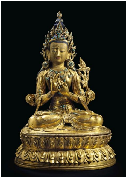
Lot 397 - A gilt bronze figure of Maitreya Tibet, 16 th /17 th century 22 1/8 in. (56.3 cm.) high Estimate: $300,000-500,000