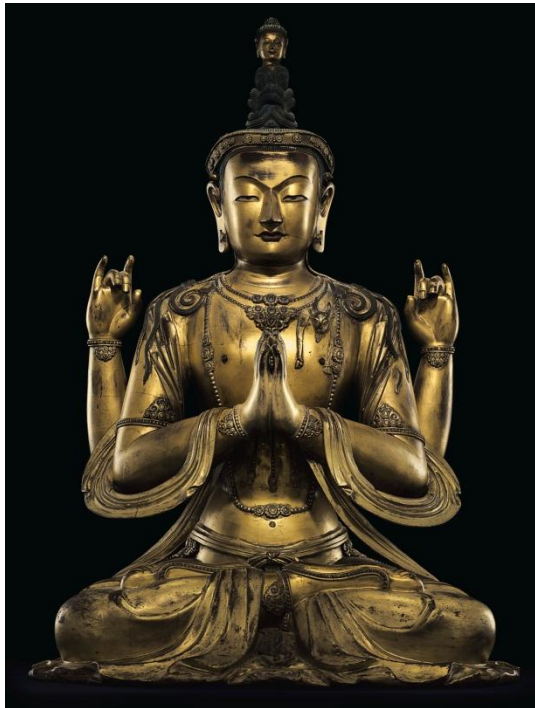
Lot 218 - A gilt and lacquered wood figure of Shadakshari Mongolia, 17 th /18 th century 35 1/2 in. (90.2 cm.) high Estimate: $250,000-350,000