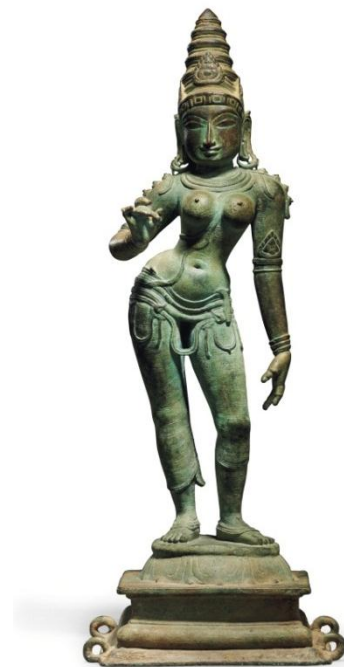
Lot 237 - A bronze figure of Parvati South India, Chola period, circa 1200 25 1/2 in. (65 cm.) high Estimate: $250,000-350,000