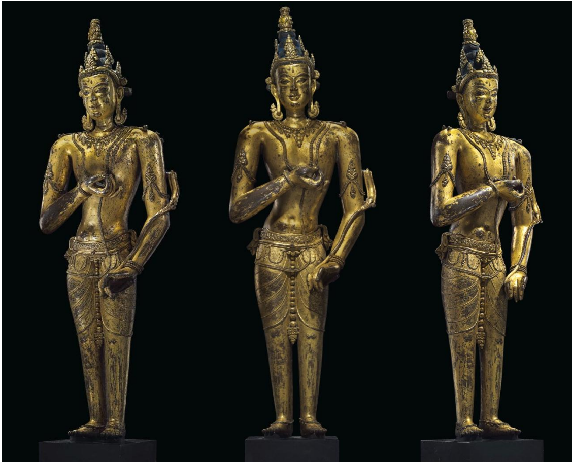
Lot 336 - An important and large gilt bronze figure of bodhisattva Tibet, 9 th /10 th century 43 ¼ in. (110 cm.) high Estimate upon request

New York - On March 19, Christie's saleroom will be devoted to the classical works of Indian and Southeast Asian Art. Christie's will offer an extensive selection of over 200 lots of sculpture, paintings, ritual objects, and works of art from India, Tibet, Nepal and Southeast Asia. Highlights include a Tibetan gilt bronze figure of a bodhisattva ( pictured above ), a Gandharan bronze figure of Buddha from the 6 th /7 th century ( pictured page 2 ), and a South Indian Chola bronze figure of Vinadhara Dakshinamurti ( pictured page 2 ).