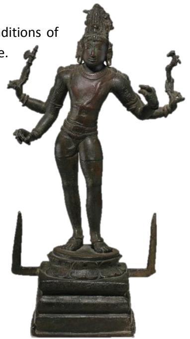
Lot 220 - A Bronze Figure Of Shiva Vinadhara Dakshinamurti South India, Chola period, 21 ¾ inches (54.3 cm) high Estimate: $400,000-600,000

A magnificent figure of Buddha is one of the largest of its kind, at over one foot in height, belonging to an extremely rare type of bronze cast in the regions of ancient Gandhara and the Swat Valley in the 5 th through 7 th centuries ( pictured left ; estimate: $500,000-700,000). Also contributing to the work's importance is that it still carries its backplate, a combined nimbus and aureole with radiating spokes with an extremely rare motif of flying geese. As the goose is a traditional Indian symbol for the soul, it represents the notion of reincarnation, and is thus an appropriate visual symbol for the Buddhist pursuit of transformation.