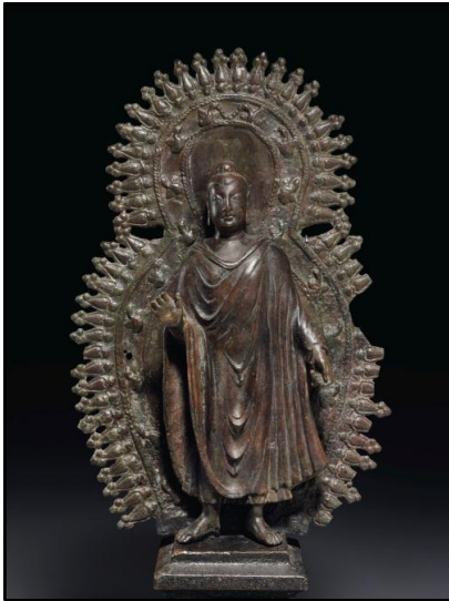
Lot 210 - A bronze figure of Buddha Gandhara, 6th/7th century 14 ¼ in. (36.2 cm.) high Estimate: $500,000-700,000

Also among the highlights of the sale is a bronze figure of Shiva Vinadhara Dakshinamurti, one of four types of supreme teachers of ultimate awareness, understanding, and knowledge ( pictured right ; estimate: $400,000-600,000). Executed during the Chola period in Southern India, this representation of Vinadhara bears close resemblance to that of Tripuravijaya, the vanquisher of the triple-city of demons, based on the iconographic convergence between the two forms. A consignment of the Dharma Collection, this bronze has an exceptional pedigree, having been exhibited at several notable institutions, including the Art Institute of Chicago, the Cleveland Museum of Art, and the Museum of Fine Arts in Boston.