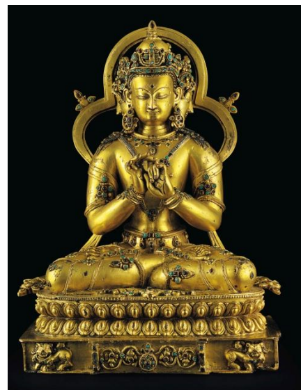
Lot 335 - A gilt bronze figure of Vairochana Tibet, Densatil, 14 th century 11 ½ in. (29.2 cm.) high Estimate: $400,000-600,000