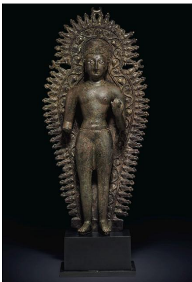
Lot 211 - A bronze figure of Buddha Kashmir, 7 th /8 th century 19 in. (48.9 cm.) high Estimate: $500,000-700,000