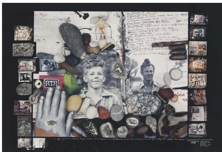
PETER BEARD, Diary Page , 1978 unique chromogenic print with handwork and affixed collage elements, printed 1997 Estimate: $50,000-70,000