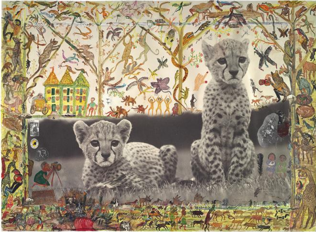
Peter Beard, Orphaned Cheetah Cubs, Mweiga, Kenya, 1968 , printed 1998. $150,000-250,000

New York – On October 3 rd , Christie's will offer Into Africa: Photographs by Peter Beard , an auction devoted specifically to the work of the much-beloved artist. Comprised of 28 works, the sale represents many of Beard's most celebrated and sought-after images and ephemera, including examples from his first one-man show at the International Center of Photography. Many of the works presented within this sale were originally gifted by the artist, and together they portray the breadth and scope of the artist's career, ranging from his well-known images of threatened African animals to his fashion photographs and elaborate diary pages. Estimates within the selection begin at $1,000 and reach up to $300,000.