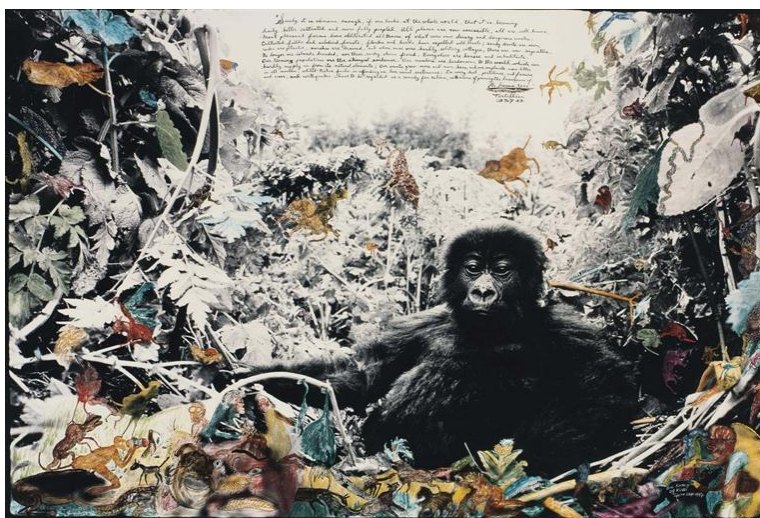
PETER BEARD, One Year Old Mountain Gorilla, Rwanda , 1984 unique chromogenic print, printed c. 1999 Estimate: $40,000 - 60,000