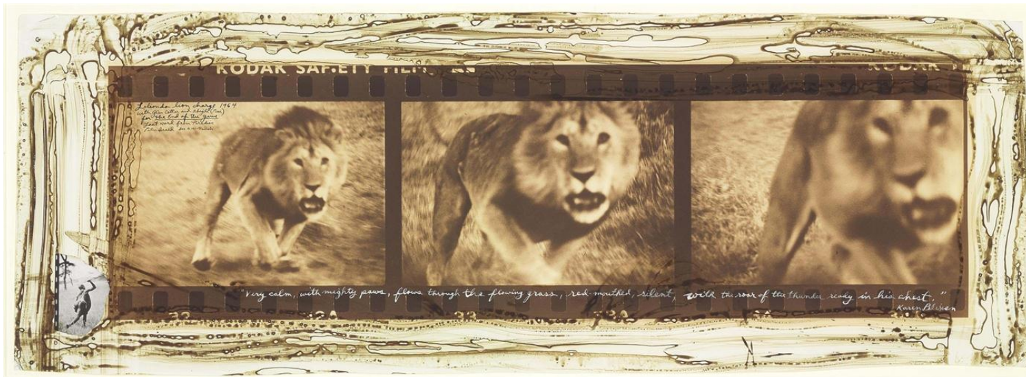
PETER BEARD, Loliondo Lion Charge , 1976 unique gelatin silver print with blood and collage, printed later Estimate: $40,000-60,000