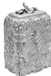
A George II Silver Sugar Box Mark Of Paul De Lamerie, London, 1746 Estimate: $30,000 - 50,000