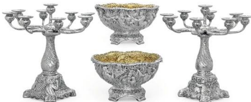
Tiffany Silver Table Garniture: A Pair Of Nine-Light Candelabra And A Pair Of Centerpiece, Bowls, Mark Of Tiffany & Co., New York, Circa 1883 Estimate: $250,000 - 350,000