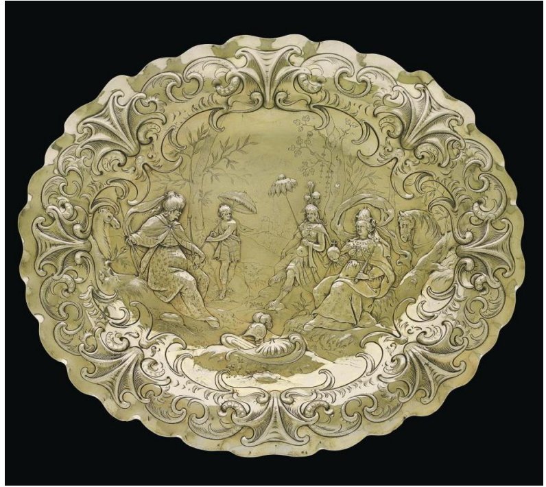
A Monumental German Silver-Gilt Sideboard Dish, David I Schwestermüller, Augsburg, Circa 1650 ($150,000 – $250,000)

New York – On October 23, Christie's Important Silver sale will present 189 precious works in silver and gold by the 17 th -century German goldsmith David I Schwestermüller, and English silversmiths Paul de Lamerie, Hester Bateman and Paul Storr. Among the sale's many highlights is a group of works from Paul de Lamerie, including a Fine George II Silver Cake Basket, 1739 (estimate: $150,000-250,000) – pictured left , which with its significant weight and exquisite ornamentation, represents the height of fashion in the 1730's.