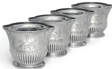
A Rare Set Of Four George III Silver Verrieries Mark Of Benjamin Smith, London, Three 1807, One 1808 Estimate: $40,000 - 60,000