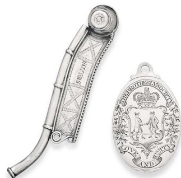
A George III Engraved Silver Medal And Boatswain's Whistle, Mark Of Hester Bateman, London, 1781 And 1777 Estimate: $2,500 - 3,500