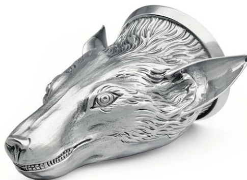
A George III Silver Stirrup Cup, Mark Of Hester Bateman, London, 1774 Estimate: 7,000 - 10,000