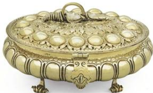
A Fine Charles II Silver-Gilt Sugar Casket Mark Of Thomas Jenkins, London, 1677 Estimate: $50,000 - 80,000