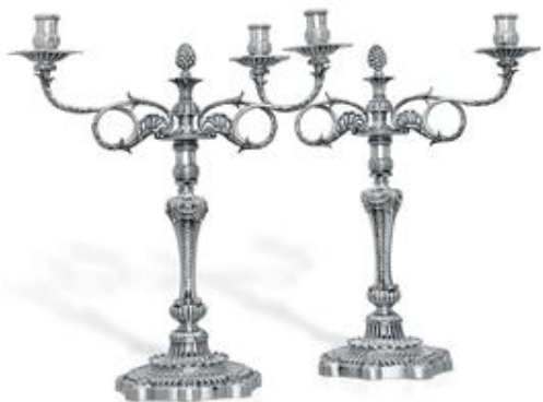
A Pair Of Regency Silver Two-Light Candelabra Mark Of Paul Storr, London, 1811 Estimate: $50,000 - 80,000