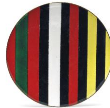
ETTORE SOTTASS TONDO, CIRCA 1958-1960 executed by Bucci , for Il Sestante , enamel on copper, slightly concave stamped mark Il Sestante and applied paper label 341 9000 to underside 8 in. (20.2 cm.) diameter