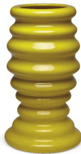
ETTORE SOTTASS MONUMENTAL VASE, 1968 executed by the Manifattura Societa Ceramica Toscana, ceramic with gloss-glaze painted mark Sottsass Italy to underside 18 ¾ in. (48 cm.) high