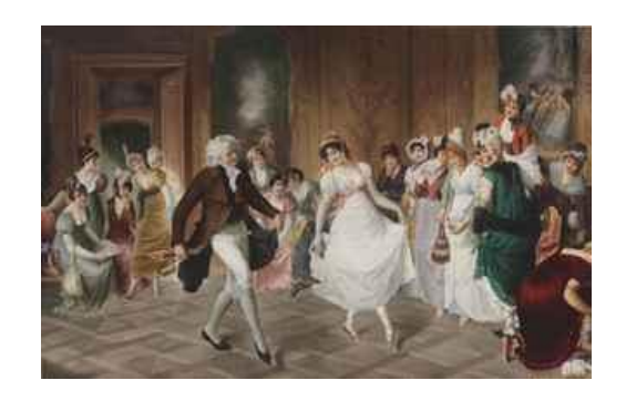
A Berlin (K.P.M.) Porcelain Rectangular Plaque, The Dancing Lesson Of Our Grandmother Late 19th/20th Century Estimate: $50,000 - 70,000