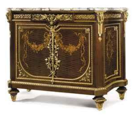
A French Ormolu-Mounted Mahogany, Stained Fruitwood, Marquetry And Parquetry Commode Last Quarter 19th Century Estimate: $30,000 – 50,000