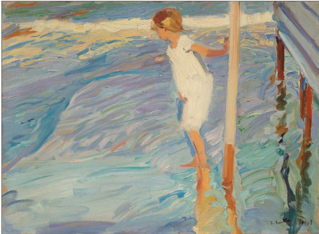
Joaquin Sorolla y Bastida (Spanish, 1863-1923) Miedo al agua oil on canvas, 51 x 70cm. Estimate: £500,000-800,000