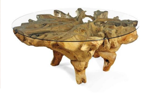
A large rootwood circular centre table late 20th century Estimate: £2,000 – 4,000