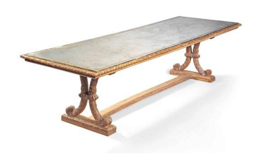
A French limed-oak dining table, mid- 20^{\text{th}} century Estimate: £2,000 - 3,000