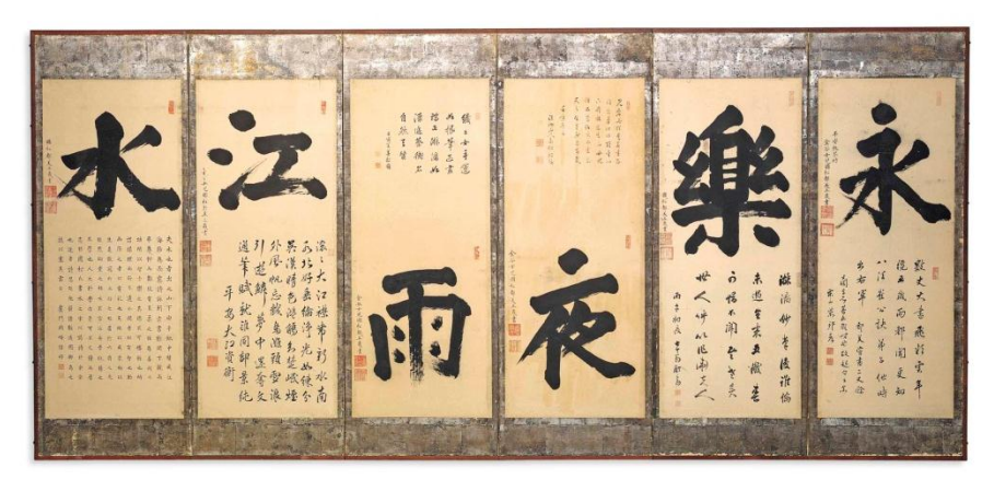
A Japanese Six-Fold Screen Edo period (18th century) Estimate: £3,000 - 4,000