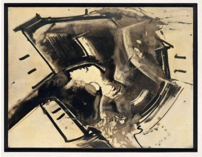
Gianni Bertini (Italian, b.1922) Untitles Estimate: £1,500 – 2,500