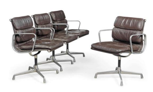
A set of four soft pad armchairs, designed by Charles and Ray Eames 1968, for Herman Miller Estimate: £2,000 – 3,000