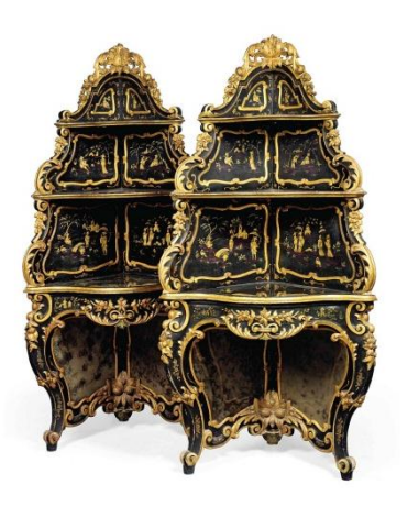
A pair of North Italian greenjapanned and parcel-gilt corner etageres, mid-19th century Estimate: £2,500 – 4,000