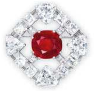
10.10 Carats Burmese No Heat Pigeon's Blood Red Ruby And Diamond Brooch, By Cartier

HK$35,500,000-50,000,000 US$4,500,000-6,500,000