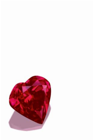
2.09 Carats Fancy Red Diamond And Diamond Ring, By Moussaieff

HK$28,000,000-38,000,000 US$3,500,000-4,800,000