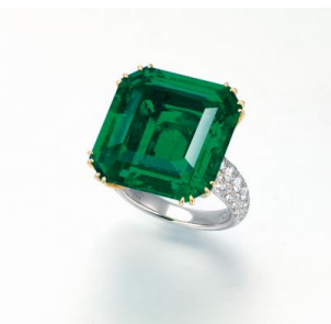
20.69 Carats Colombian No Oil Emerald Ring

HK$20,000,000-30,000,000 US$2,500,000-3,750,000