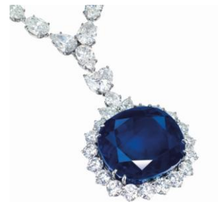
101.32 Carats Ceylon No Heat Sapphire And Diamond Pendant Necklace, By Chatila

HK$22,000,000-30,000,000 US$2,800,000-3,800,000