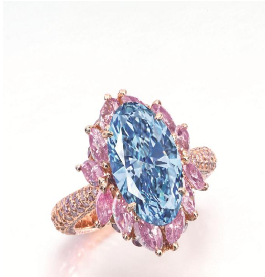
3.39 Carats Fancy Vivid Blue Diamond Ring, By Moussaieff

HK$28,000,000-38,000,000 US$3,500,000-4,800,000