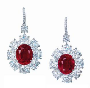
A Pair Of 4.25 And 4.18 Carats Burmese No Heat Pigeon's Blood Red Ruby And Diamond Ear Pendants

HK$20,000,000-30,000,000 US$2,500,000-3,750,000