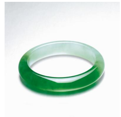
A Jadeite Bangle

HK$28,000,000-38,000,000 / US$3,500,000-4,750,000