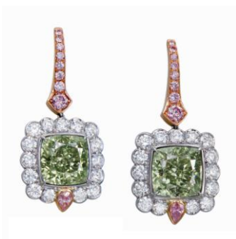
A Pair Of 5.64 Carats Fancy Intense Green And 5.18 Carats Fancy Intense Yellowish Green Diamond And Diamond Earrings

HK$12,000,000-18,000,000 / US$1,500,000-2,250,000