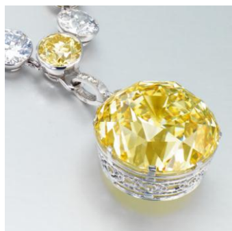
Belle Époque 52.26 Carats Fancy Intense Yellow Cushion-Shaped Diamond And Diamond Pendant Necklace

The sale also offers a diverse number of coloured-diamond jewels, including a unique Belle Époque 52.26 carats fancy intense yellow cushion-shaped diamond, a pair of 5.64 carats fancy intense green and 5.18 carats fancy intense yellowish green diamond earrings, as well as a fancy pink internally flawless clarity Type IIa diamond weighing 5.42 carats.