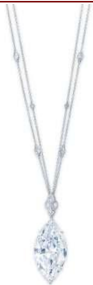
50.62 Carats Marquise-Cut D Coloured VVS2 Clarity (Potential) Type IIa Diamond Pendant Necklace

HK$38,000,000-58,000,000 US$4,800,000-7,500,000