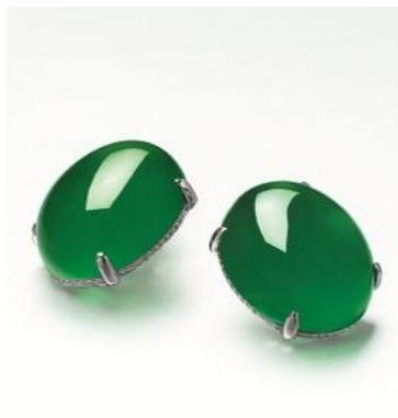
A Magnificent Pair Of Jadeite And Diamond Ear Studs

HK$12,000,000-18,000,000 / US$1,500,000-2,250,000