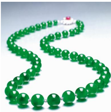
A Jadeite Bead And Diamond Necklace

Jadeite continues to be a pivotal part of the jewellery auction at Christie's Hong Kong. Particularly popular in various Asian regions, jadeite is commonly assessed and categorised by its colour, translucency, texture and cut. High quality jadeite must be not treated at all, and shall display a harmonious combination of tone, saturation, evenness and hue. A trio of notable lots embodies these elements, including a magnificent pair of jadeite and diamond ear studs, a jadeite bead and diamond necklace and a jadeite bangle.