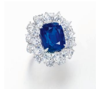
19.36 Carats Cushion-Shaped Kashmir Sapphire And Diamond Ring

In addition, sapphire lovers will be delighted to see two brilliant blue beauties, a 101.32 carats Ceylon no heat sapphire by Chatila and a magnificent 19.36 carats cushion-shaped Kashmir sapphire. Located high in the Himalayas, the mines of Kashmir have sourced the world's finest and most sought-after sapphires whose unrivalled cornflower blue ensures its position as the most desirable sapphire on the market.