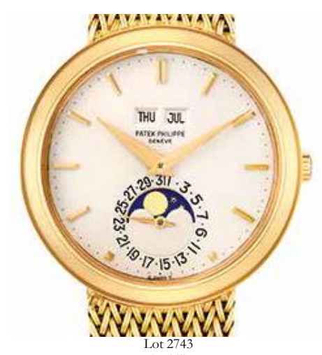
Patek Philippe. A Very Fine and Rare 18k Gold Automatic Perpetual Calendar Bracelet Watch with Moon Phases. Signed Patek Philippe, Geneve, Ref 3448, Manufactured In

This season's vintage section is highlighted by four classic masterpieces, including two Patek Philippes—one is an Extremely Fine and Very Rare Stainless Steel Chronograph Wristwatch, Ref. 1579, circa 1945 (illustrated on page 1, HK$1,600,000 -$2,400,000 / US$200,000 - $300,000), and the other is a Bracelet Watch, Ref. 3448, circa 1970. Rolex wristwatches also offer two important wristwatches, the "Milsub", an automatic Wristwatch Made for the British Royal Navy, Ref. 5513/5517, circa 1975 and the "Killy", a Triple Calendar Chronograph Wristwatch, Ref. 6036, circa 1953.