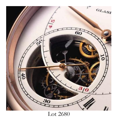
A. Lange & Söhne. A Very Fine and Rare 18k Pink Gold Tourbillon Wristwatch with Patented Stop Seconds Mechanism, Pivoting Segment Dial and Chain Fusée. Signed A. Lange & Söhne, Glashütte I/Sa, Richard Lange Tourbillon Pour Le Mérite, Ref. 760'032, Circa 2012