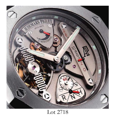
Audemars Piguet. A Very Fine and Important Alacrite 602 and Titanium Limited Edition Tonneau-Shaped Semi-Skeletonised Tourbillon Wristwatch with Power Reserve and Dynamographe Indication. Signed Audemars Piguet, Royal Oak Concept Model, Ref. Gw 1, Circa 2004

This section is highlighted by three exceptional pieces, each from an industry heavyweight, including Audemars Piguet, Hublot and A. Lange & Söhne.