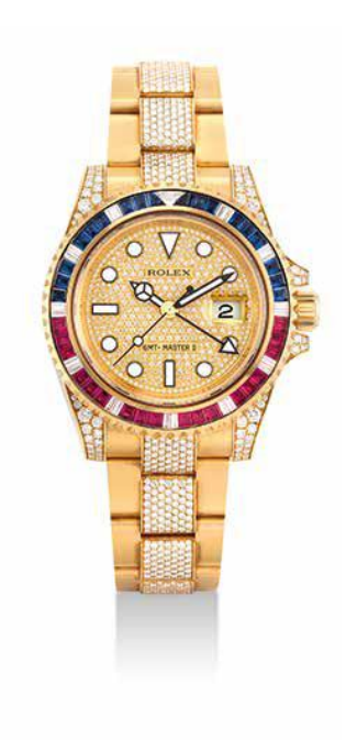
Lot 2627 Rolex. A Very Fine and Rare 18k Gold, Diamond, Sapphire and Ruby-Set Automatic Dual Time Wristwatch with Sweep Centre Seconds, Date and Bracelet. Signed Rolex, GMT-Master II "Saru" Model, Ref. 116758, Circa 2006

HK$750,000-1,000,000 / US$95,000-130,000