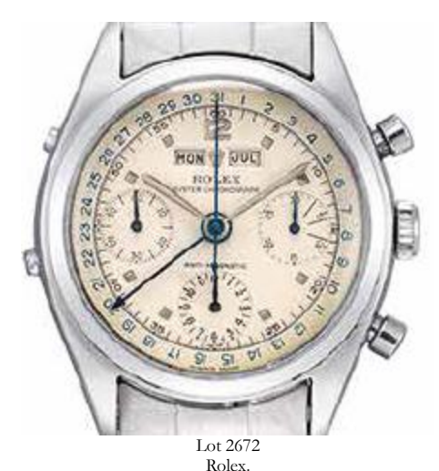
A Very Fine, Attractive and Extremely Rare Stainless Steel Triple Calendar Chronograph Wristwatch with Bracelet. Signed Rolex, Oyster Chronograph, Anti-Magnetic, "Killy", Ref. 6036, Circa 1953