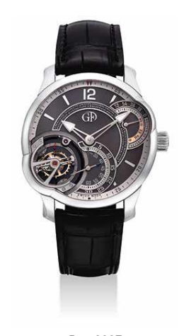
Lot 2287 Greubel Forsey.

A Very Fine, Important and Very Rare Platinum Asymmetrical 25° Inclined 24 Seconds Tourbillon Wristwatch with 72 Hours Power Reserve.