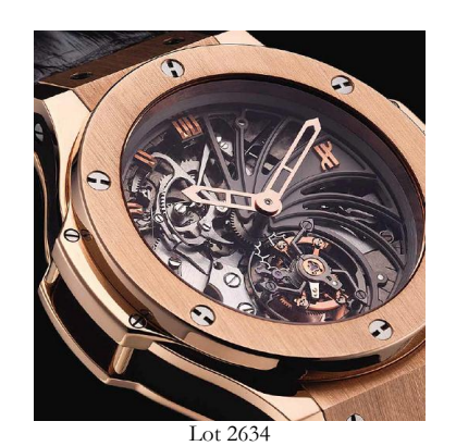
Hublot. A Fine and Very Rare 18k Pink Gold Limited Edition Semi-Skeletonised Minute Repeating Tourbillon Wristwatch. Signed Hublot, Big Bang Model, No. 1/10, Ref. 304.Px.1180.Lr, Circa 2014

HK$1,000,000-1,900,000 / US$130,000-250,000