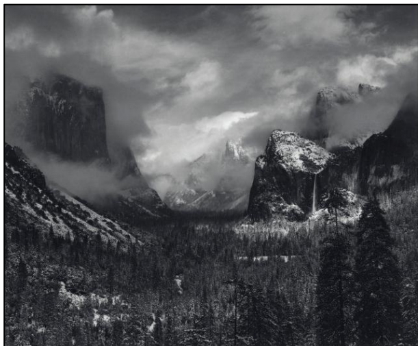
Ansel Adams Clearing Winter Storm, Yosemite Valley, c. 1939 gelatin silver mural print, printed 1970s Estimate: $200,000-300,000