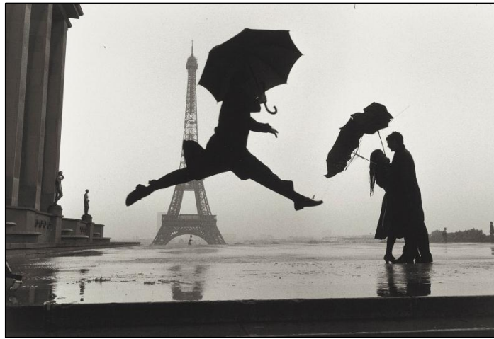
Elliott Erwitt Paris, 1989 gelatin silver print Estimate: $4,000-6,000