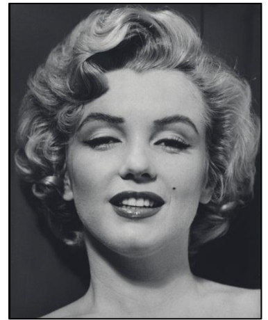
LEFT: Edouard Boubat, Lella, Bretagne, France, 1948 , gelatin silver print, Estimate: $6,000-8,000