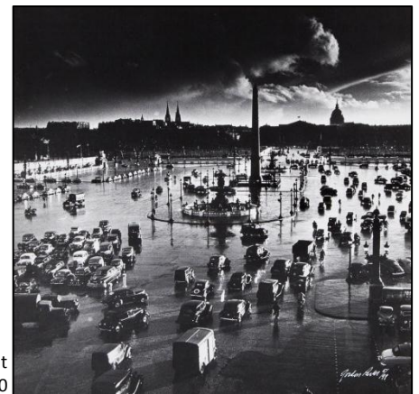
Gordon Parks, Place de la Concorde, Paris, France , 1950, gelatin silver print Estimate: $7,000-9,000

Christie's first online-only Photographs sale of the season, April in Paris , will be open for bidding from March 28 through April 10 and will feature 58 classic black & white images that capture life and the city from the 1920's-1950's. Ranging in price from $1,500 to $20,000, the sale presents a fantastic opportunity for collectors of all levels to acquire works from some of the greatest photographers of the 20 th century, including pioneers of photojournalism Henri Cartier-Bresson, Edouard Boubat and Robert Doisneau, as well as André Kertész, Brassai and René-Jacques.