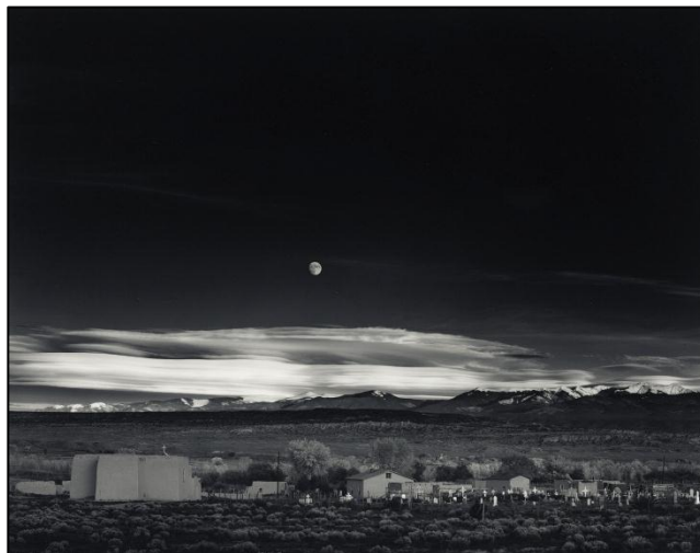
Ansel Adams Moonrise, Hernandez, Northern New Mexico, 1941 gelatin silver print, printed 1973 Estimate: $50,000-70,000