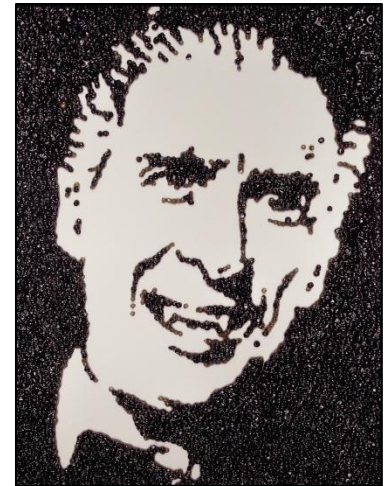
Vik Muniz Dracula , from ' Caviar Monsters ,' 2004 chromogenic print, flush-mounted on aluminum Estimate: $50,000-70,000