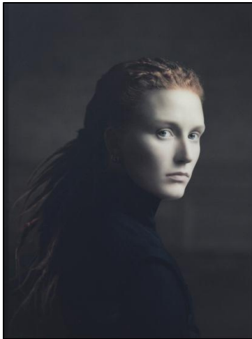
Desiree Dolron Xteriors IV , 2001 chromogenic print, face-mounted on Plexiglas, flush-mounted, printed 2005 Estimate: $60,000-80,000