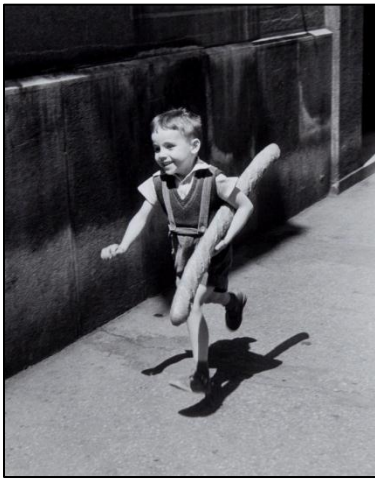
Willy Ronis Petit Parisien, 1952 gelatin silver print Estimate: $5,000-7,000