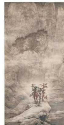
Image Link: https://www.dropbox.com/sh/9bbdt7vdz2p4new/AADRalR9yjiVV54gwLgiuhBa?dl=0

Lot 915, LI HUAYI (B. 1948), Snow-covered Mountains Scroll, mounted and framed Ink and colour on paper, 136 x 68 cm., Estimate: HK$2,200,000-3,200,000/ US$290,000-420,000