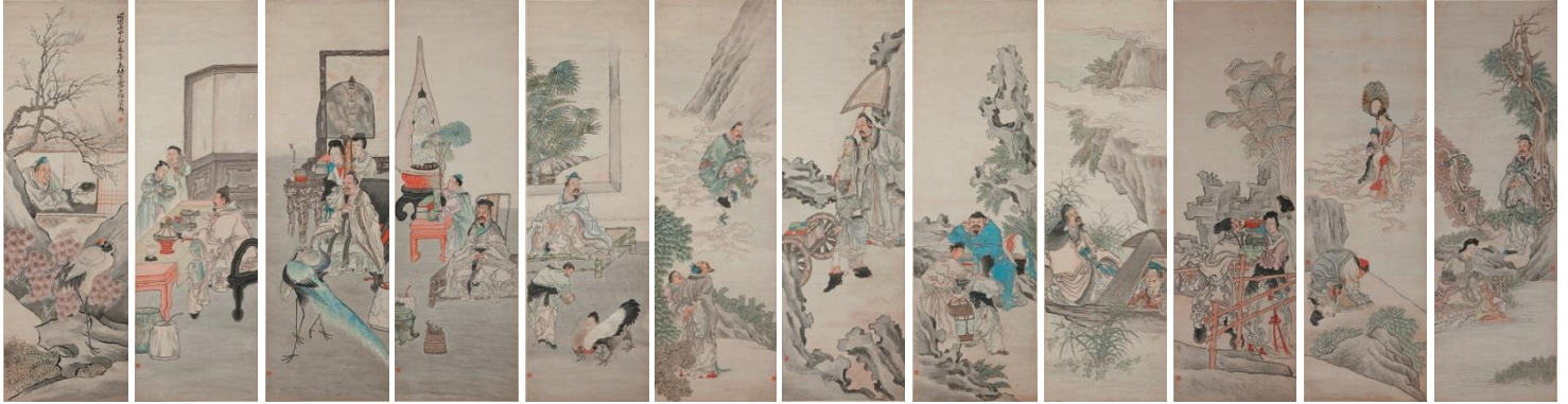
Lot 1067, REN XUN (1835-1893), Folk Tales , A set of twelve hanging scrolls, ink and colour on paper, Each scroll measures 178.5 x 54.5 cm., Dated 1872, Estimate: HK$8,000,000-10,000,000/ US$1,100,000-1,300,000