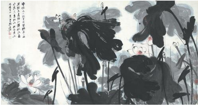
Left: Lot 1497, ZHANG DAQIAN (1899-1983), Lotus Pond , Scroll, mounted and framed, ink and colour on paper, 95 x 179.5 cm Estimate: HK$1,500,000-2,500,000/ US$200,000-320,000