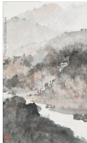
Lot 1541, FU BAOSHI (1904-1965), Dreaming of Chateau de Montlys , Scroll, mounted and framed, ink and colour on paper, 76.2 x 45.2 cm., Dated 1945, Estimate: HK$4,000,000-6,000,000/ US$520,000-770,000