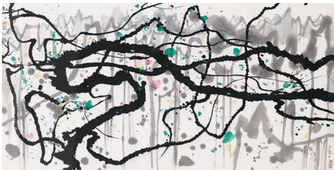
Lot 1388, WU GUANZHONG (1919-2010), Pine Soul , Scroll, mounted and framed, ink and colour on paper, 70 x 138 cm., Estimate: HK$8,000,000-10,000,000/ US$1,100,000-1,300,000

Wu Guanzhong long admired the majestic two thousand year-old pine trees on the Tai Mountains, known as the Fifth-Rank Pine. When he first climbed the Tai Mountains in the 1980s, the artist sketched the pine tree from numerous angles in an attempt to capture its spirit. “I tried to capture the soul of the pine, to represent its struggles and jaggedness with wild ink lines, with lines in continuous motion freeing its noble soul...” Wu expressed Pine Soul depicts the magnificent branches of the pine trees, with an interplay between Wu’s artistic development of abstraction together with his memories from his journeys to the Tai Mountains (Lot 1388).