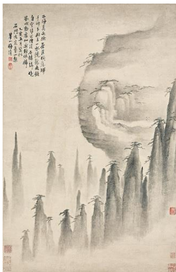
Lot 1116, MEI QING (1623-1697) Two Immortals on Huangshan Hanging scroll, ink on paper, 75 x 48 cm., Dated 1695 Estimate: HK$2,500,000-3,500,000/ US$330,000-450,000