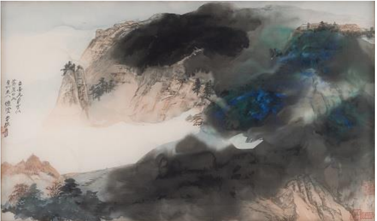
Lot 1528, ZHANG DAQIAN (1899-1983), Living in the Mountains , Scroll, mounted and framed, ink and colour on silk, 72 x 102.7 cm., Dated 1969, Estimate: HK$16,000,000-22,000,000/ US$2,100,000-2,800,000

Hong Kong – Christie's presents a series of Chinese painting auctions, ranging from exceptional classical calligraphy and modern paintings to contemporary ink. Two important private collections, Feng Wen Tang and K'ung Hsiang-Hsi, complete the sales. The auctions will take place on 1 st and 2 nd June 2015 at the Hong Kong Convention and Exhibition Center and are estimated to realise over HK$313 million / US$40 million.