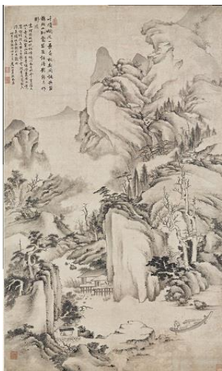
Lot 1115, DAI BENXIAO (1621 - 1693) Boating on a Mountain Stream Hanging scroll, ink on paper, 152.5 x 90.5 cm., Dated 1690 Estimate: HK$3,500,000-4,500,000/ US$460,000-580,000

Fine Chinese Classical Paintings and Calligraphy features 175 works from the 14 th to 19 th century. A calligraphic masterpiece by Wang Duo and landscape paintings by Dai Benxiao and Mei Qing are some highlights of the auction.