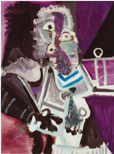
THE MILES AND SHIRLEY FITERMAN COLLECTION