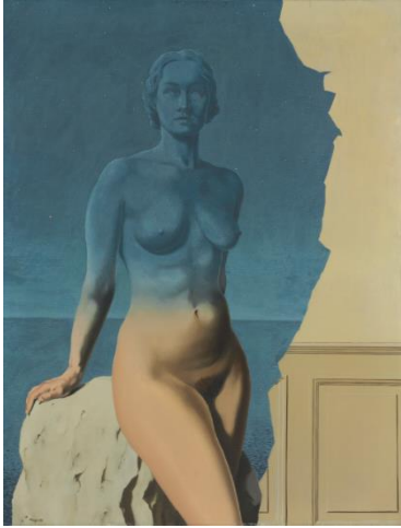
PROPERTY OF A LADY René Magritte (1898-1967)