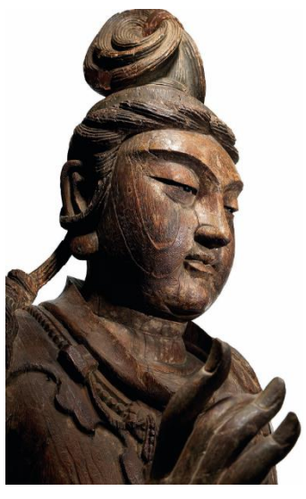
AN IMPORTANT AND EXCEEDINGLY RARE WOOD FIGURE OF GUANYIN