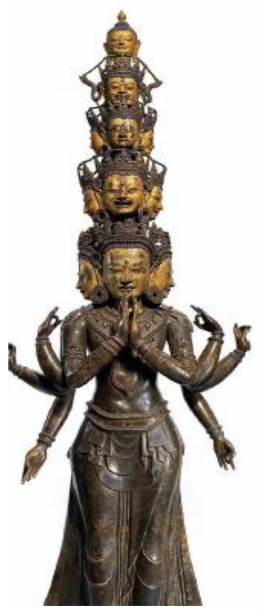
AN EXCEPTIONALLY RARE AND