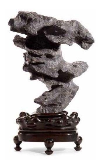
AN INSCRIBED AND DATED LINGBI CLOUD-FORM SCHOLAR'S ROCK

Assembled from a notable private collection, the present offering reflects the tradition of Chinese scholar's rocks as understood by connoisseurs and selected based on exceptional provenance. One such rock and a top highlight of the sale is a dark-grey Lingbi stone, which bears the signatures of celebrated painters Jin Nong (1687-1763) and Gao Fenghan (1683–1749).