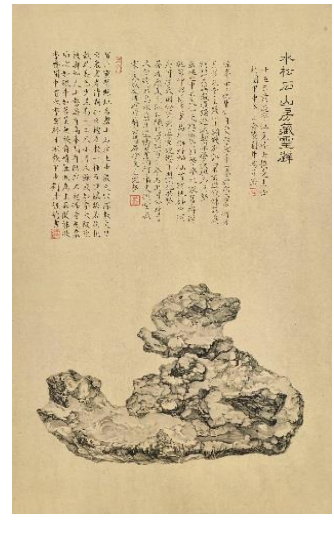
LIU DAN - Rock of the Water, Pine and Stone Retreat

<u>Pine Tree on a Cliff</u> (illustrated bottom right) by Li Huayi resembles the monumental Northern Song painting in spirit, yet the method with which the artist experiments is fundamentally a mix of old and new. To create the momentous presence, Li splashes ink onto paper, allowing it to flow freely to form the underlying composition before arduously adding realistic details using the fine brush gongbi technique. With fantastical grey and black clouds obscuring the mountainscape in a dramatic light, the resulting image is at once intimidating yet intimate, radiating a quiet energy.