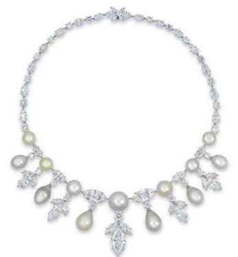
Lot 2059 An elegant natural pearl and diamond necklace, by Moussaieff

Two one-of-a-kind pieces of jewellery round up the seasonal highlights. One is a thick semi-cylindrical jadeite bangle characterized by a vivid emerald green on light green ground and high translucency features a width of approximately 18.1mm and a thickness of 8.3mm. The other is an elegant natural pearl and diamond necklace by Moussaieff. As most pearls in the market are cultured, high-quality natural pearls are greatly sought after. In addition, natural pearls in large size and with a good lustre are increasingly difficult to find due to water pollution. The present lot features a series of large natural white and cream button pearls, alternating with marquise-cut diamonds, suspending a fringe of white and cream natural pearl drops. Assembling a matching selection of natural pearls of this size and quality is very rare and exceptional and therefore this pearl necklace is worthy of great interest.