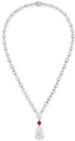
Lot 2088 A Unique Diamond And Coloured Diamond Pendant Necklace, by Nirav Modi

Estimate: HK$15,000,000-25,000,000 (US$2,000,000-3,200,000)