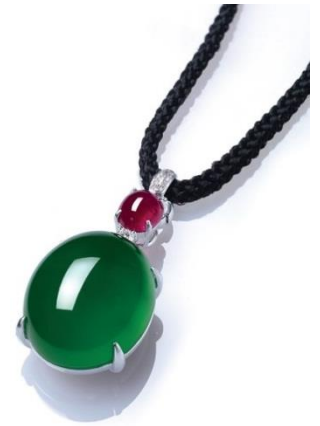
Lot 2097 A highly important jadeite, ruby and diamond pendant necklace

Amongst the dazzling array of diamond pieces in this collection, the most notable one is a unique diamond and coloured diamond pendant necklace by Nirav Modi. Set with a 10.02 carats D colour internally flawless clarity (Type IIa) pear-shaped diamond, the necklace features a hexagonal-shaped fancy purplish red diamond weighing 1.03 carats, joined to the neckchain set with navette-shaped brilliant-cut diamond links assembled by combining two calibr -cut crescent-shaped diamonds.