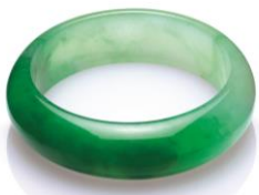
Lot 2070A An important jadeite bangle

Estimate: HK$12,000,000-18,000,000 (US$1,500,000-2,300,000)