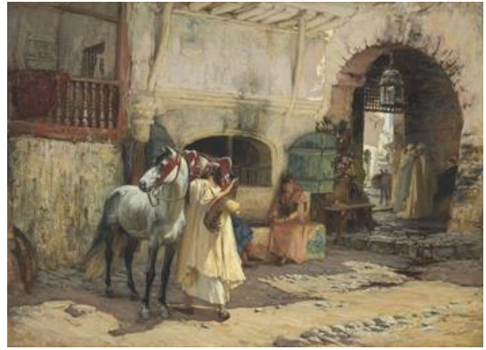
Lot 72 | Frederick Arthur Bridgman (American, 1847-1927) Off for a Ride, Constantine, Algeria oil on canvas Estimate: $100,000 – 150,000