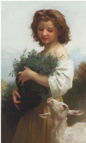
Lot 42 | William Adolphe Bouguereau (French, 1825-1905) La petite Esméralda oil on canvas Estimate: $500,000 – 700,000