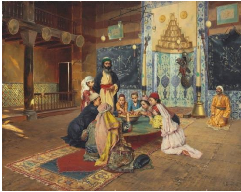
Lot 70 | Rudolf Ernst (Austrian, 1854-1943) La Charité chez les derviches à Scutari oil on panel Estimate: $200,000 – 300,000