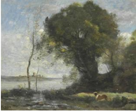
Lot 3 | Jean-Baptiste-Camille Corot (French, 1796-1875) L'étang au chien oil on canvas Painted circa 1855-1860 Estimate: $70,000 – 100,000