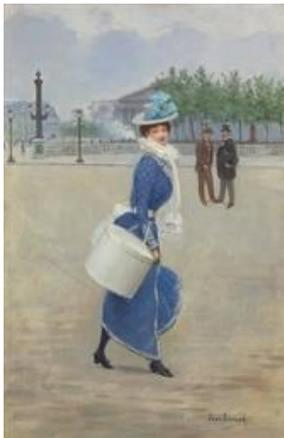
Lot 56 | Jean Béraud (French, 1849-1936) Sur la place de la Concorde oil on panel Estimate: $80,000 – 120,000