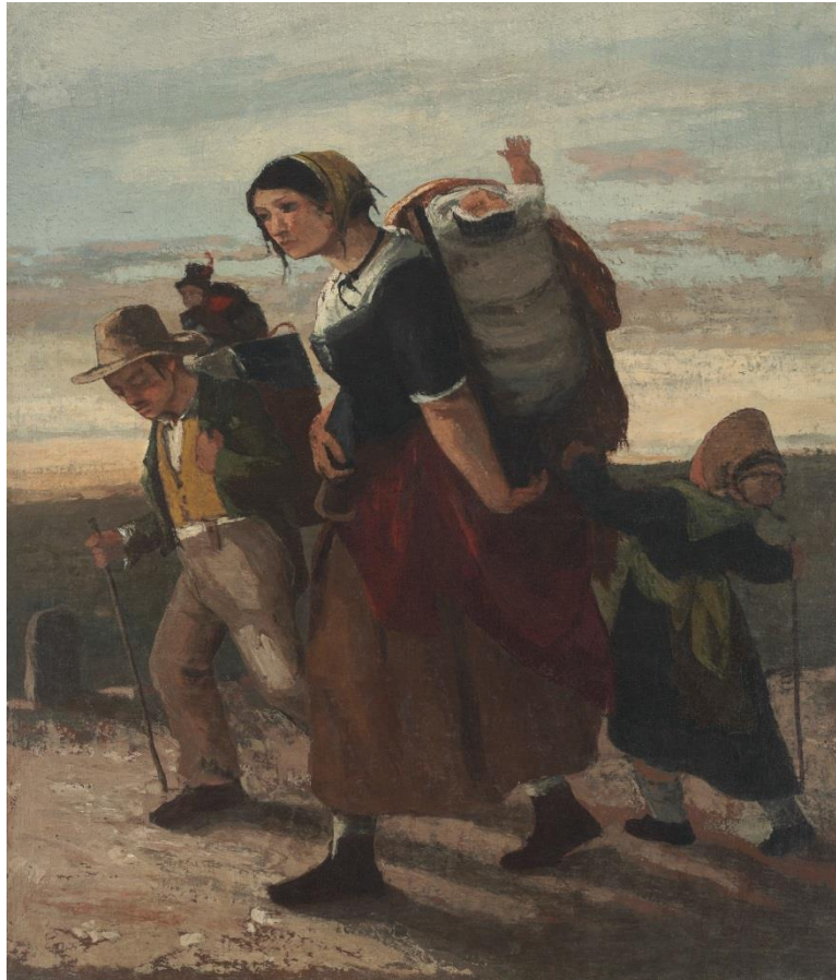
Lot 11 | Gustave Courbet (French, 1819-1877), La Bohémienne et ses enfants , oil on canvas Painted in 1853-1854 Estimate: $1,800,000 – 2,500,000

PRESS RELEASE | NEW YORK | 7 APRIL 2015 | FOR IMMEDIATE RELEASE IMPORTANT COURBET DISCOVERY AND FRESH TO THE MARKET WORKS HIGHLIGHT THE APRIL SALE OF 19 TH CENTURY EUROPEAN ART