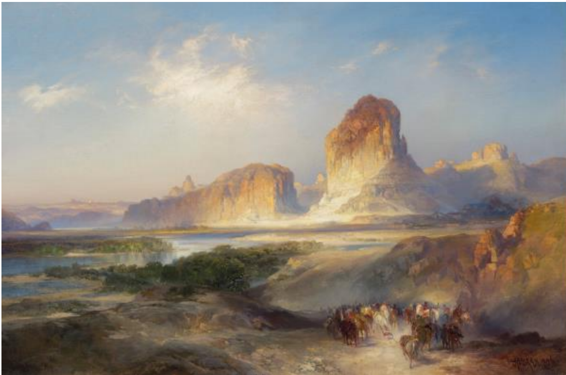
Thomas Moran (1837-1926), Green River, Wyoming , oil on canvas, painted in 1896 Estimate: $6,000,000 – 8,000,000

William I. Koch discusses his passion for the West, stating: "I am pleased to partner with Christie's in the sale of works from my personal collection. Over the years my passion for collecting has grown exponentially. Many works were purchased and intended for installation in my western town, but I am now just simply out of room! The treasures in the sale are among my favorites, but it is time to pass along these pieces of history to other collectors who share my passion for the west – a place of natural grandeur, simplicity, and codes that have strongly influenced my life."