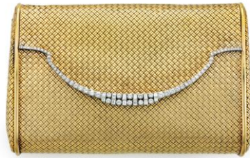
A GOLD AND DIAMOND EVENING BAG Estimate: $10,000-15,000