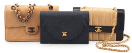
CHANEL, BLACK AND CREAM LAMBSKIN LEATHER BAG, NAVY CANVAS QUILTED CLUTCH BAG AND LIGHT BROWN LEATHER BAG, 20TH CENTURY Estimate: $500-700