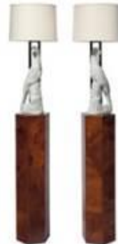
A PAIR OF CHINESE EXPORT PORCELAIN 'PHEASANT' STANDING LAMPS 20TH CENTURY, SUPPLIED BY TED GRABER, INC., CIRCA 1988 Estimate: $5,000-8,000

Formerly in The Family Residence, the White House, Washington D.C.