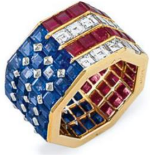
A DIAMOND, SAPPHIRE AND RUBY RING, BY BULGARI Estimate: $5,000-8,000