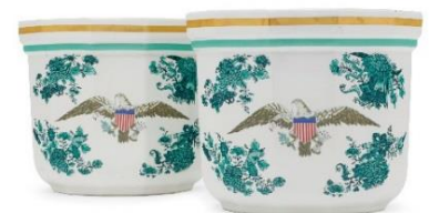
A PRIVATE COMMISSION TO COMMEMORATE THE INAUGURATION OF PRESIDENT RONALD REAGAN -A PAIR OF MOTTAHEDHI CHINESE EXPORT-STYLE PORCELAIN ICE PAILS, MODERN, BLACK PRINTED AND IMPRESSED MARKS Estimate: $2,000-4,000

A gift to President and Mrs. Ronald Reagan from Mstislav and Galina Rostropovich.