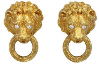
A PAIR OF DIAMOND AND GOLD EAR CLIPS BY VAN CLEEF & ARPELS Estimate: $15,000-20,000