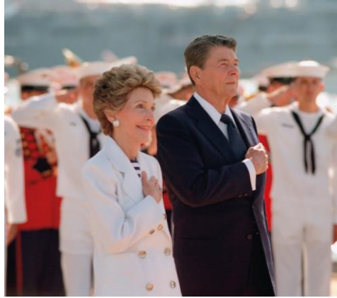
President Reagan and Nancy Reagan on the USS Iowa in New York Harbor. July 4, 1986.