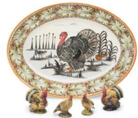
THE REAGAN FAMILY 'THANKSGIVING' PLATTER AN ITALIAN CERAMIC TURKEY PLATTER AND TWO SETS OF TURKEY-FORM CASTERS 20TH CENTURY Estimate: $500-1,000

PROVENANCE: Formerly in The Family Residence, the White House, Washington D.C.