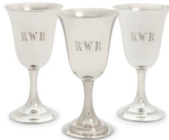
PRESIDENT RONALD REAGAN A SET OF SIXTEEN AMERICAN SILVER GOBLETS MARK OF INTERNATIONAL STERLING CO., MERIDEN, 20TH CENTURY Estimate: $1,000-1,500