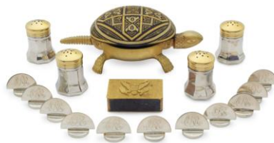
A COLLECTION OF DINING ROOM ACCESSORIES, 20TH CENTURY Estimate: $200-400

PROVENANCE: Formerly in The Family Residence, the White House, Washington D.C.