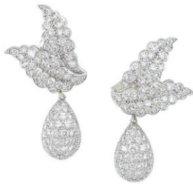
A PAIR OF DIAMOND AND PLATINUM EAR PENDANTS Clips signed V.C.A. for Van Cleef & Arpels Estimate: $5,000-7,000