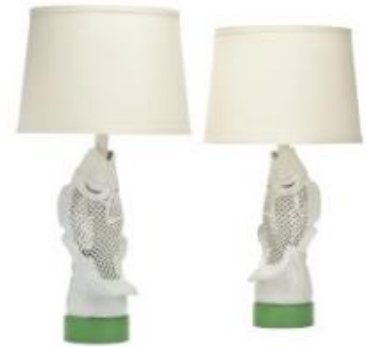
A PAIR OF WHITE PORCELAIN FISH-FORM LAMPS , 20TH CENTURY SUPPLIED BY WILLIAM (BILLY) HAINES INC., CIRCA 1970-1985 Estimate: $2,000-3,000