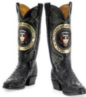
PRESIDENT RONALD REAGAN'S COWBOY BOOTS, BY TONY LAMA BOOTS, CIRCA 1980 Estimate: $10,000 – 20,000