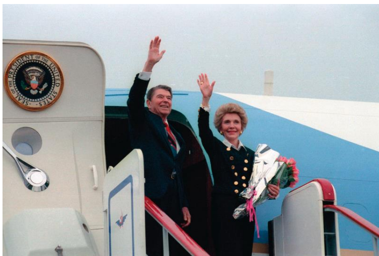
The Reagans leaving after the Moscow Summit. June 2, 1988.

SOLD TO BENEFIT THE RONALD REAGAN PRESIDENTIAL FOUNDATION & INSTITUTE