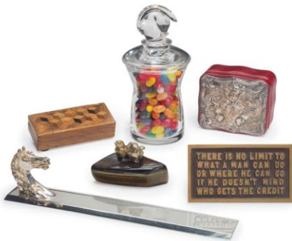
PRESIDENT RONALD REAGAN A COLLECTION OF ACCESSORIES FROM THE PRESIDENT'S DESK, 20TH CENTURY Estimate: $1,000-2,000

Formerly in The Family Residence, the White House, Washington D.C.