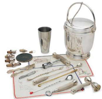
PRESIDENT AND MRS. RONALD REAGAN A COLLECTION OF BAR ACCESSORIES 20TH CENTURY Estimate: $1,000-2,000