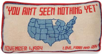
A NEEDLEPOINT CUSHION CIRCA 1984 Estimate: $1,000-1,500