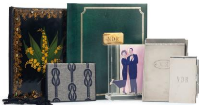
MRS. RONALD REAGAN A COLLECTION OF PERSONALIZED DESK ACCESSORIES, 19TH/20TH CENTURY Estimate: $500-1,000