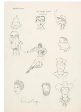
PRESIDENT RONALD REAGAN A SERIES OF PENCIL SKETCHES SIGNED "RONALD REAGAN" [WATERMARKED 1982] ON WHITE HOUSE STATIONERY Estimate: $2,500-3,500

An Inauguration gift from Mr. and Mrs. Frank Sinatra. January 20, 1981.