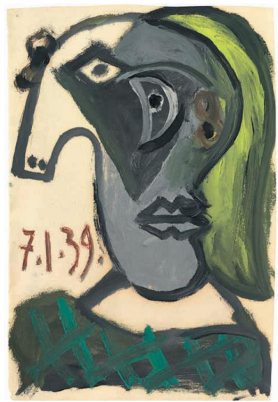
May 15 – Impressionist and Modern Evening Sale

ISAMU NOGUCHI Shiva Rock basalt Executed in 1981. $600,000-800,000