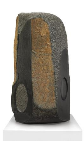
May 17 – Post War and Contemporary Evening Sale

CAMILLE PISSARRO Prairie de Bazincourt oil on canvas Painted in 1885 $1,000,000-1,500,000