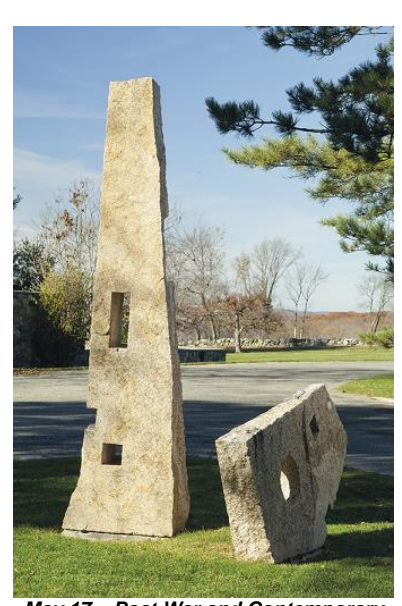
May 17 – Post War and Contemporary Evening Sale

HENRY MOORE Upright Internal/External Form bronze with green patina Executed 1952-53; cast 1953. $2,000,000-3,000,000