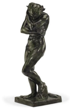
May 15 – Impressionist and Modern Evening Sale

AUGUSTE RODIN Eve, petit modèle (modèle à la base carrée et aux pieds plats) bronze with dark green and brown patina Conceived 1881, cast 1886 $2,500,000-3,500,000