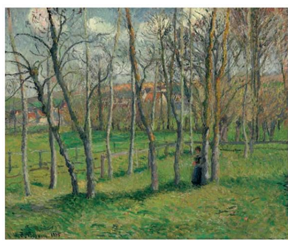
May 15 – Impressionist and Modern Evening Sale

AUGUSTE RODIN Eve, petit modèle (modèle à la base carrée et aux pieds plats) bronze with dark green and brown patina Conceived 1881, cast 1886 $2,500,000-3,500,000