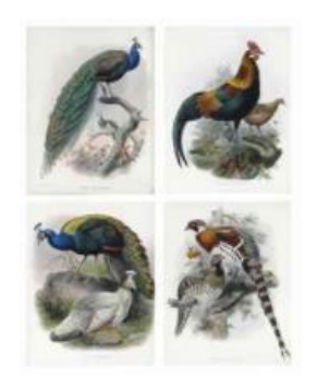
ELLIOT, Daniel Giraud. A Monograph of the Phasianidae or Family of the Pheasants. New York: by the author, [1870-]1872. $60,000-80,000