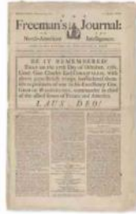
SURRENDER OF CORNWALLIS – The Freeman's Journal: or, the North-American Intelligencer. Philadelphia: Francis Bailey, October 24, 1781. No. 27. $15,000-25,000