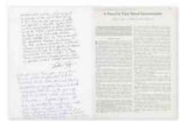
THE INTERNET – CERF, Vinton (b.1943) and KAHN, Robert (b.1938). "A Protocol for Packet Network Intercommunication," extract from: IEEE Transactions on Communications. May, 1974. Vol.Com-22, No.5. pp.637-48. $12,000-18,000